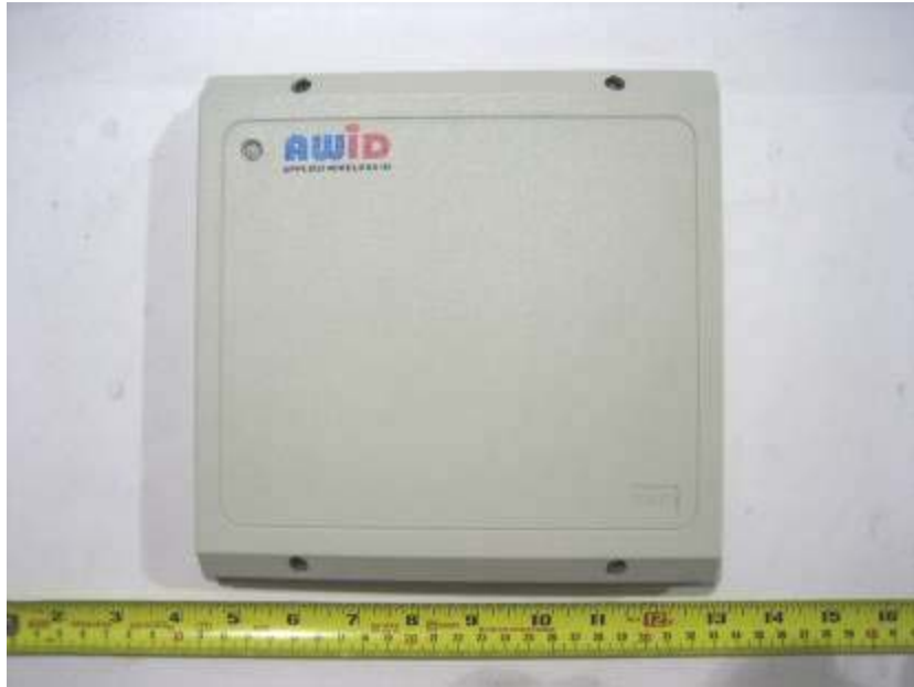
EUT Top View