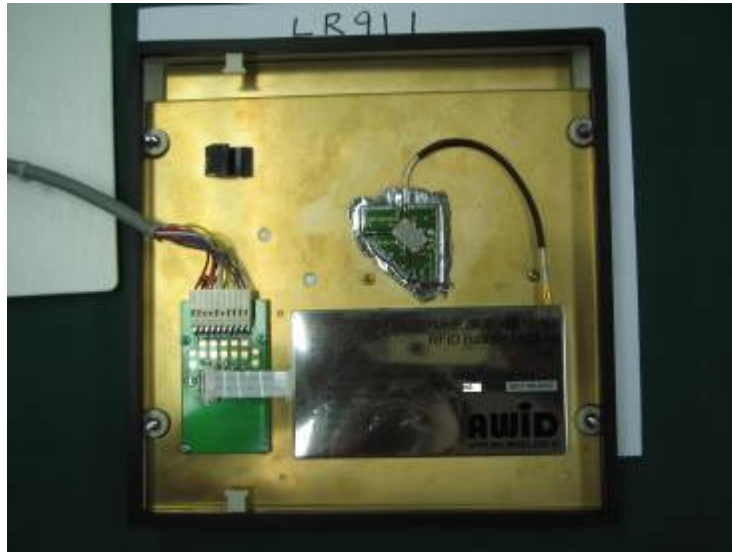
Board and Housing