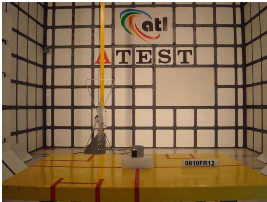
Front View of the Test Configuration