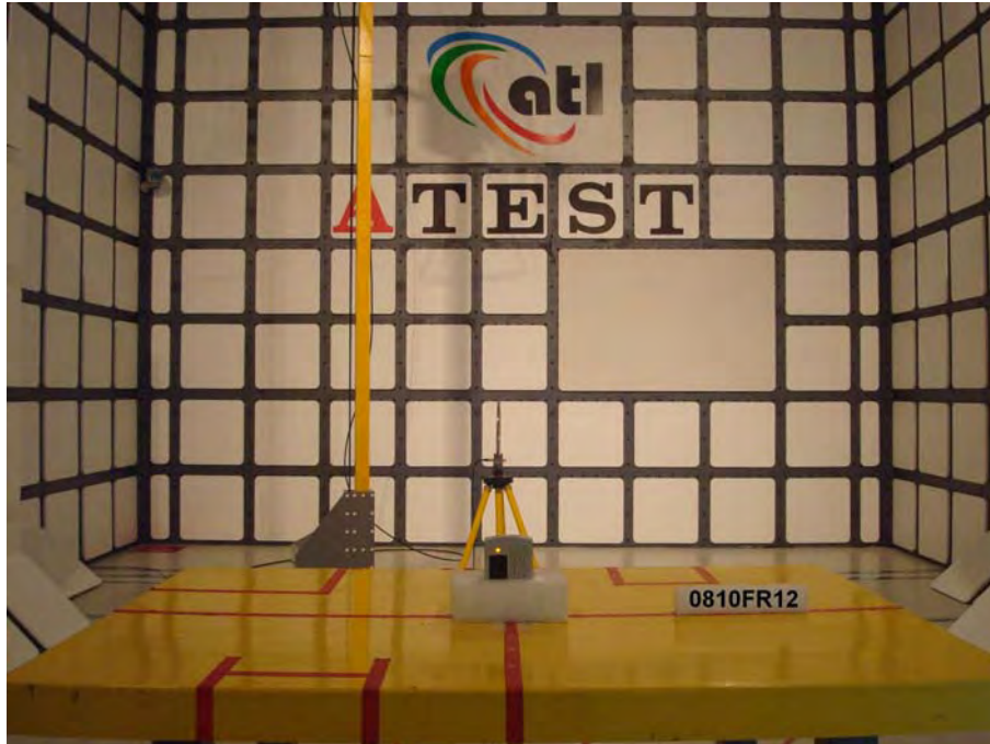
Front View of the Test Configuration