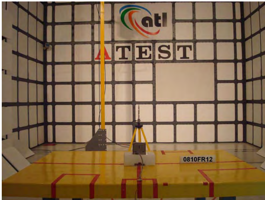
Rear View of the Test Configuration