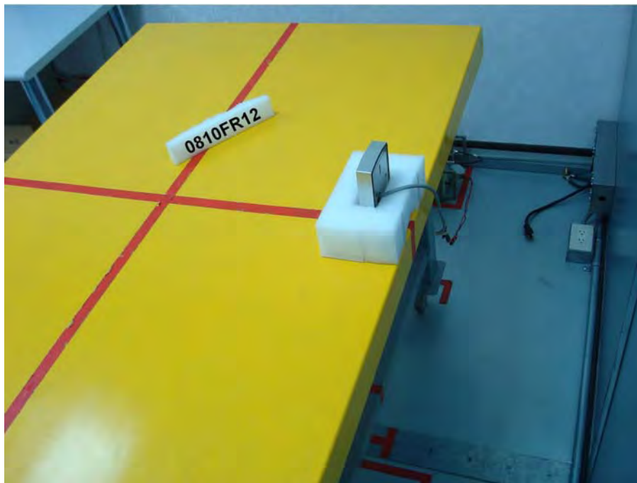
Rear View of the Test Configuration