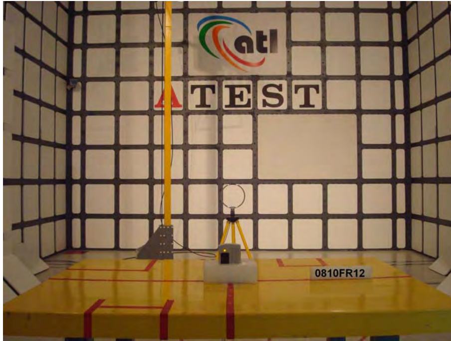
Front View of the Test Configuration