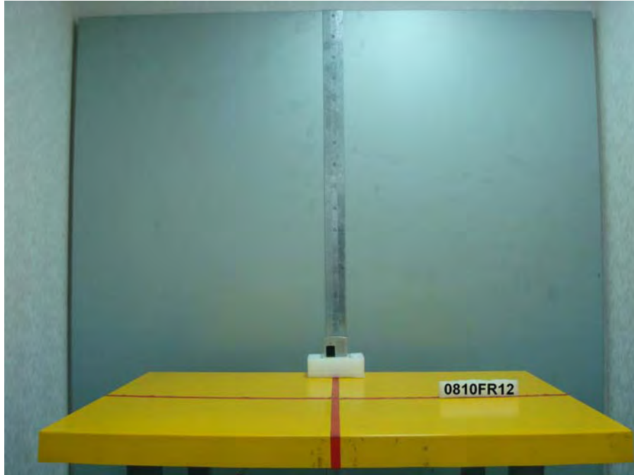
Front View of the Test Configuration