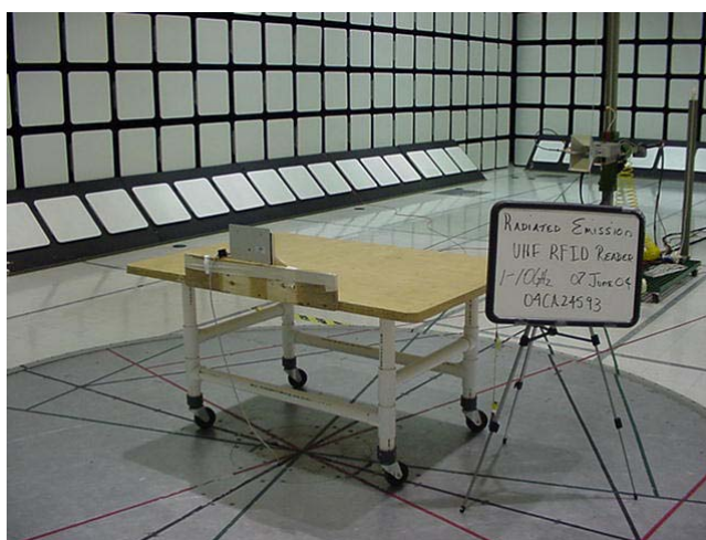
Rear - 1-10GHz