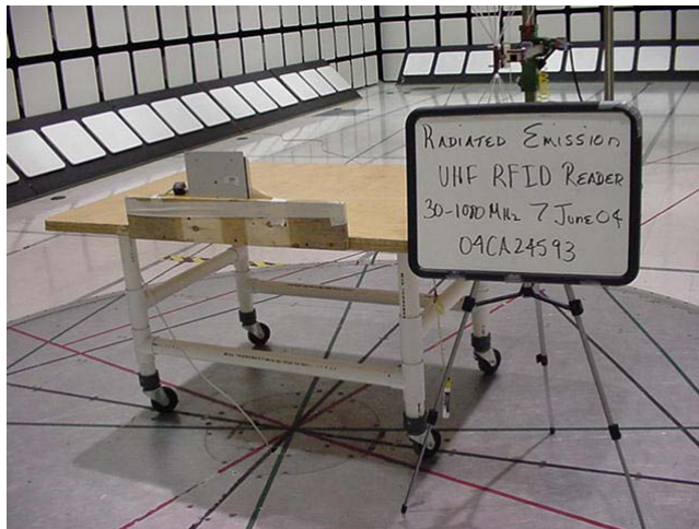
Rear – 30-1000MHz