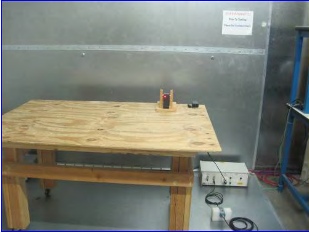
AC Line Conducted Emission - Front View