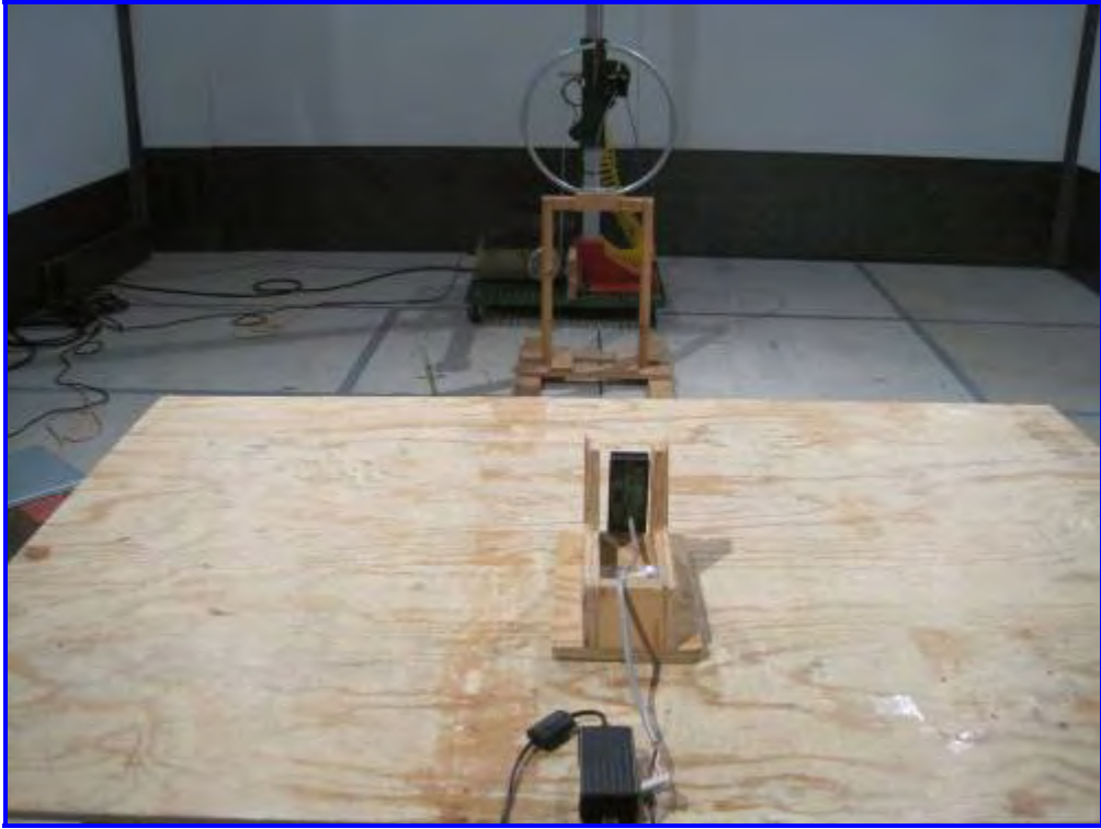
Radiated Emission (<30MHz) – Rear View