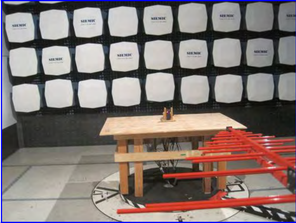
Radiated Emission (>30MHz) – Front View