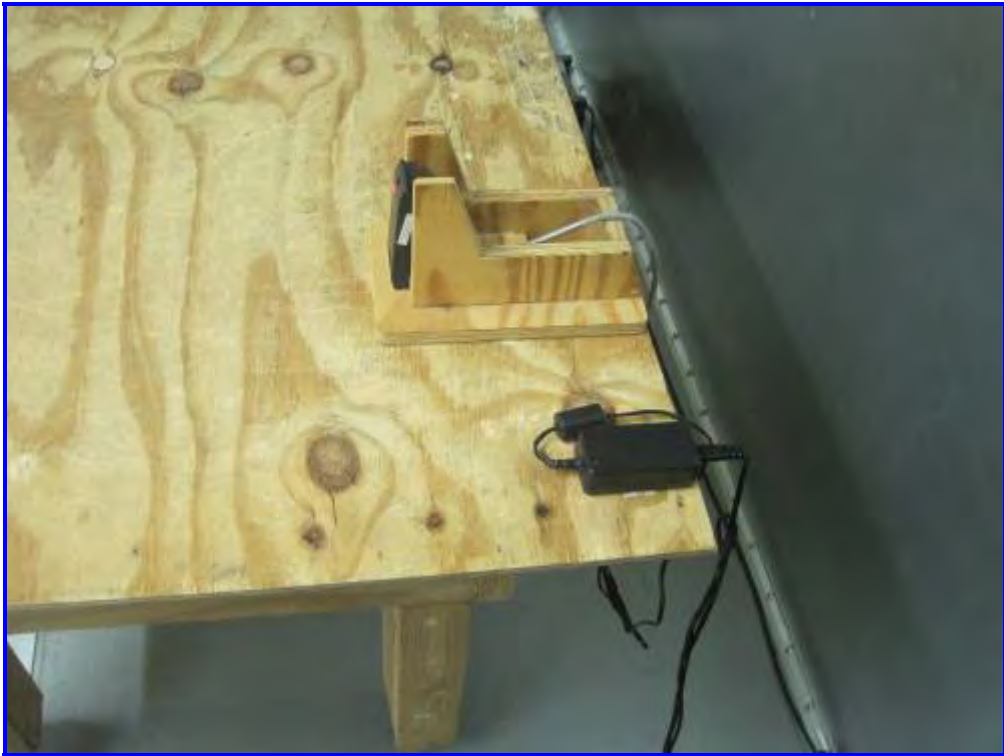
AC Line Conducted Emission - Front View