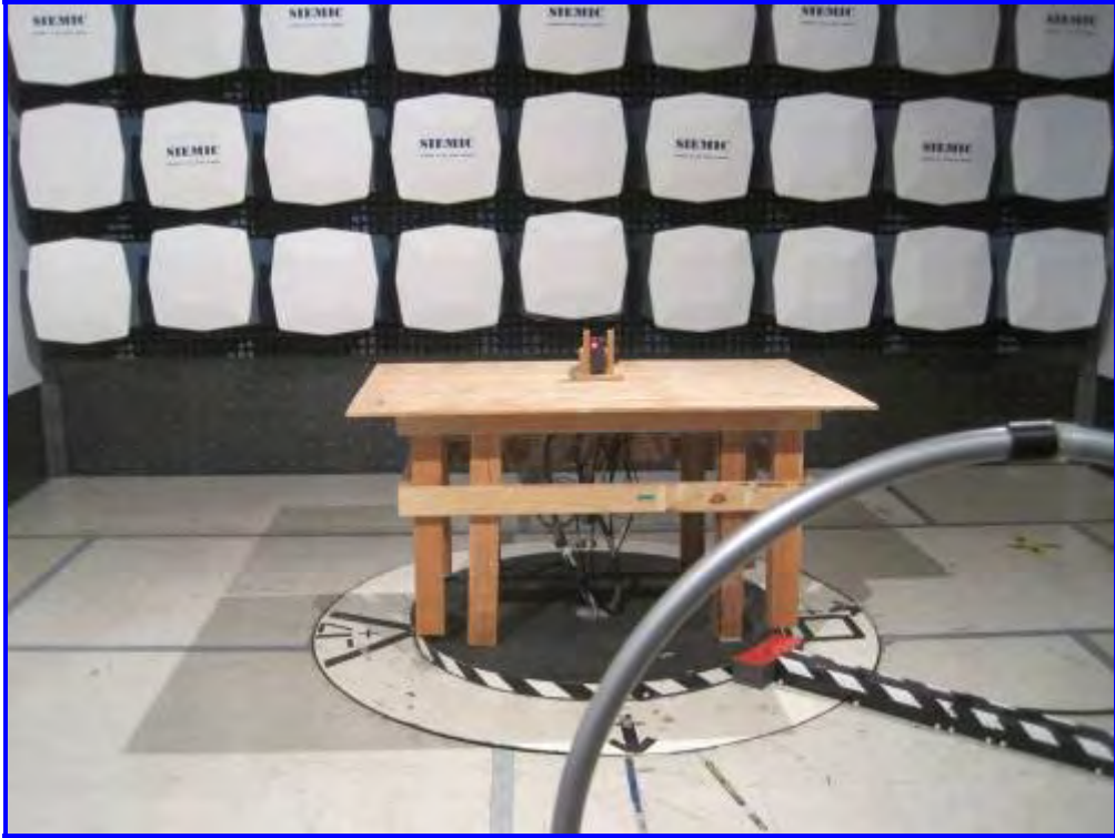
Radiated Emission (<30MHz) – Front View