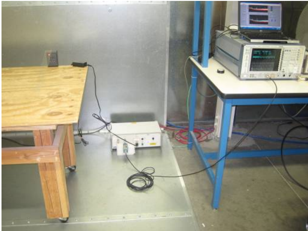
AC Line Conducted Emission Front View