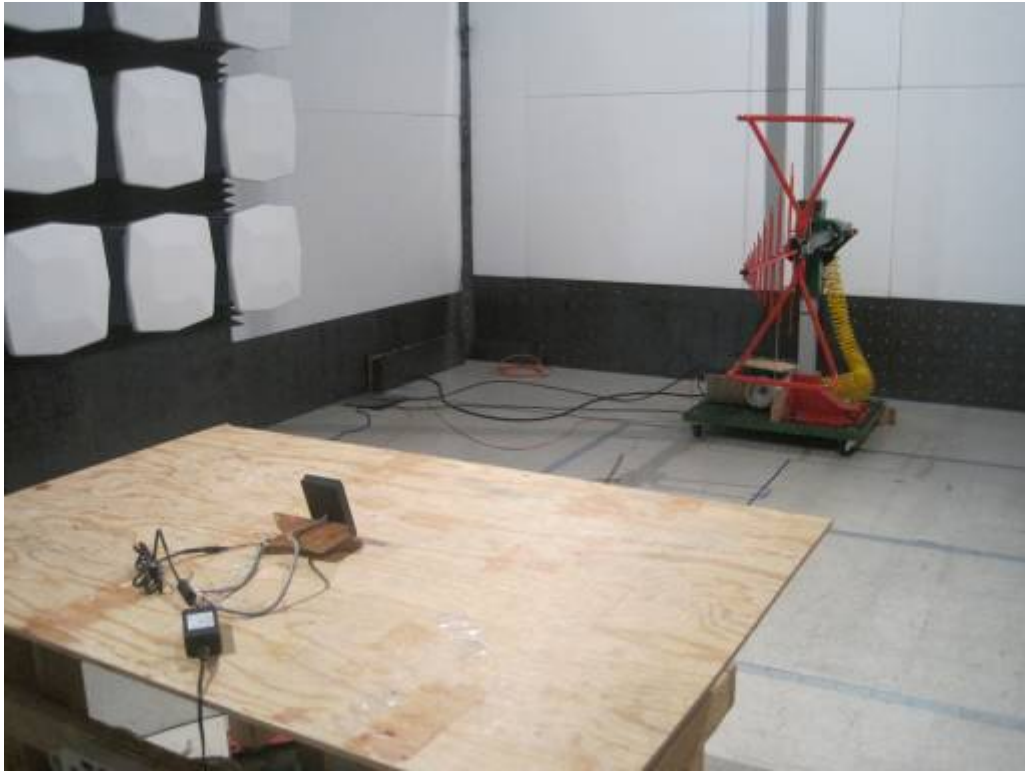
Radiated Emission View (>30MHz)