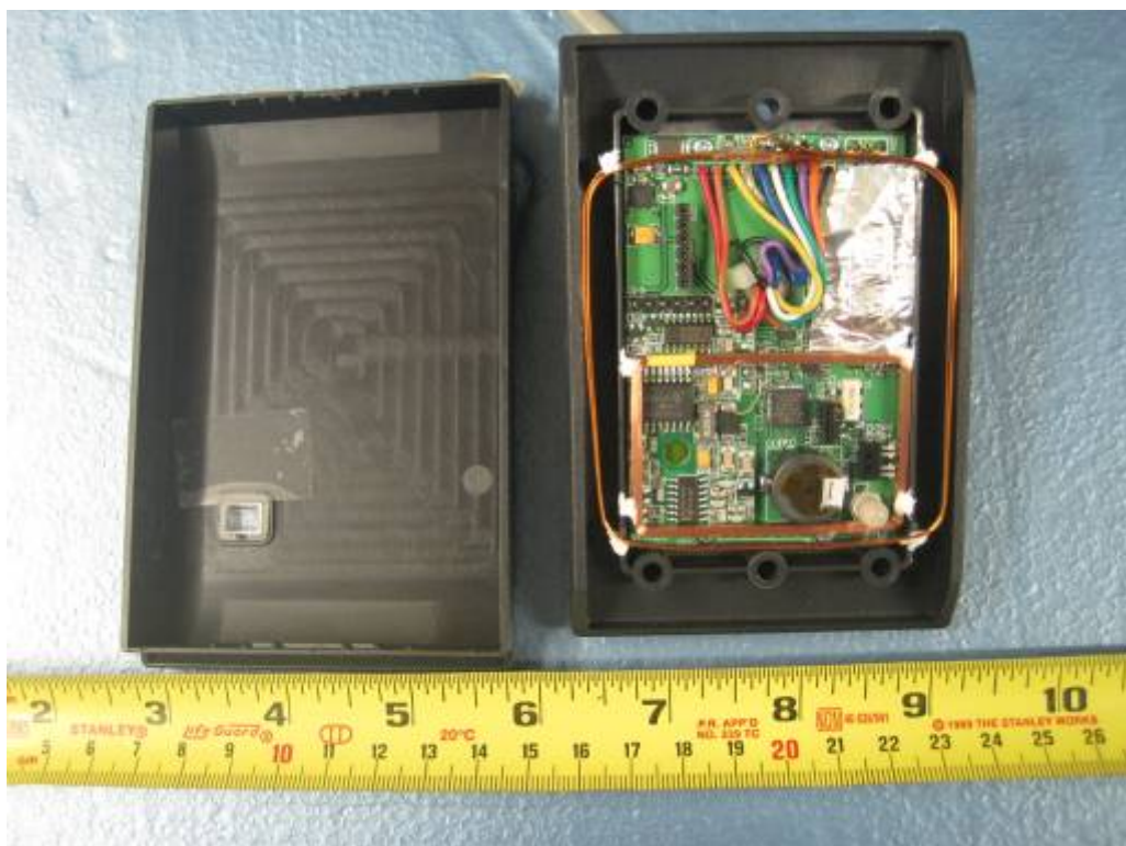
radio board – Top (with Shielding)