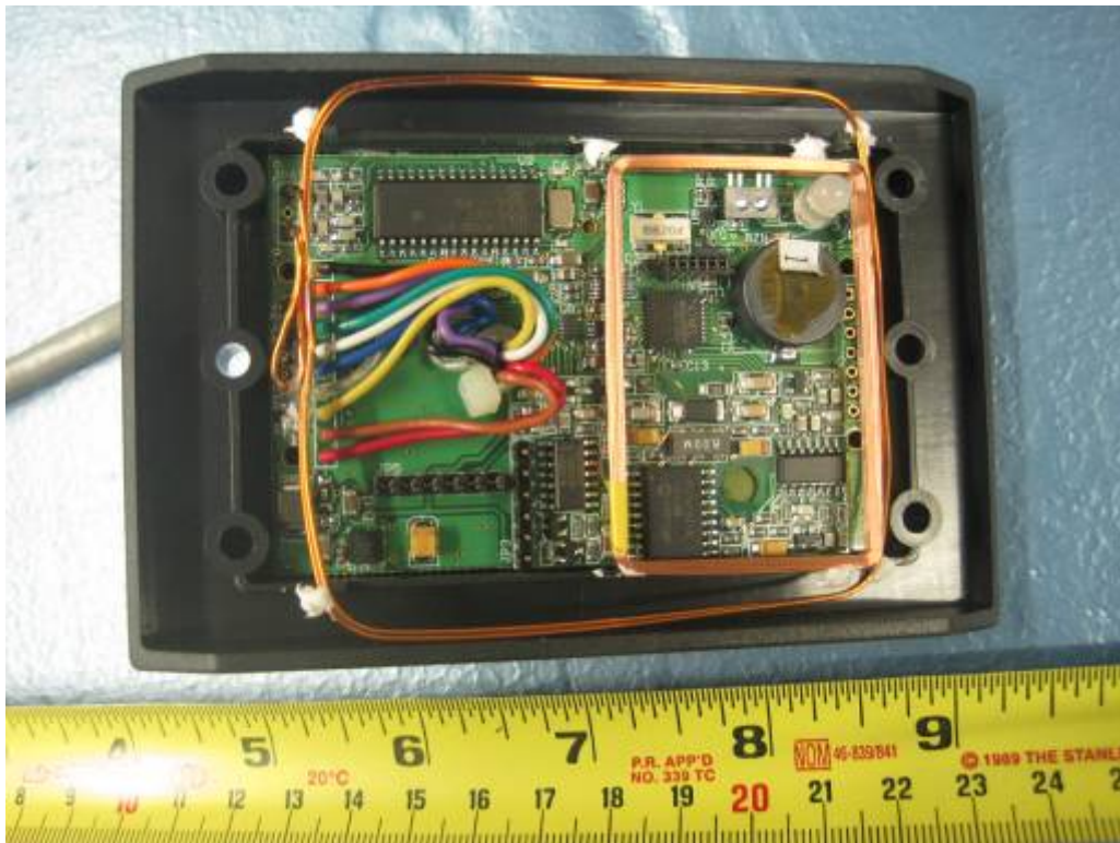
radio board – Top