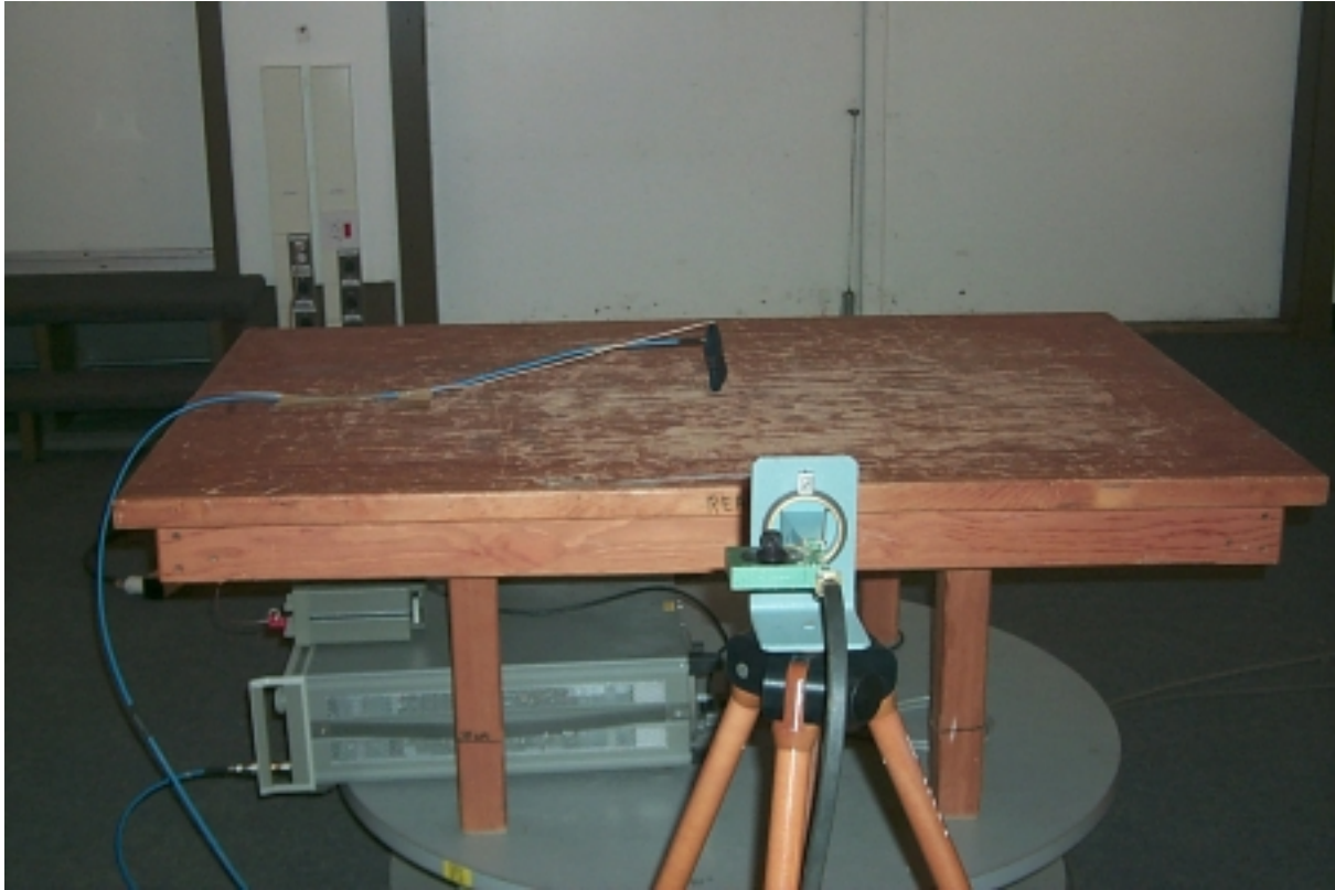
26.5-40.0Ghz emissions back side