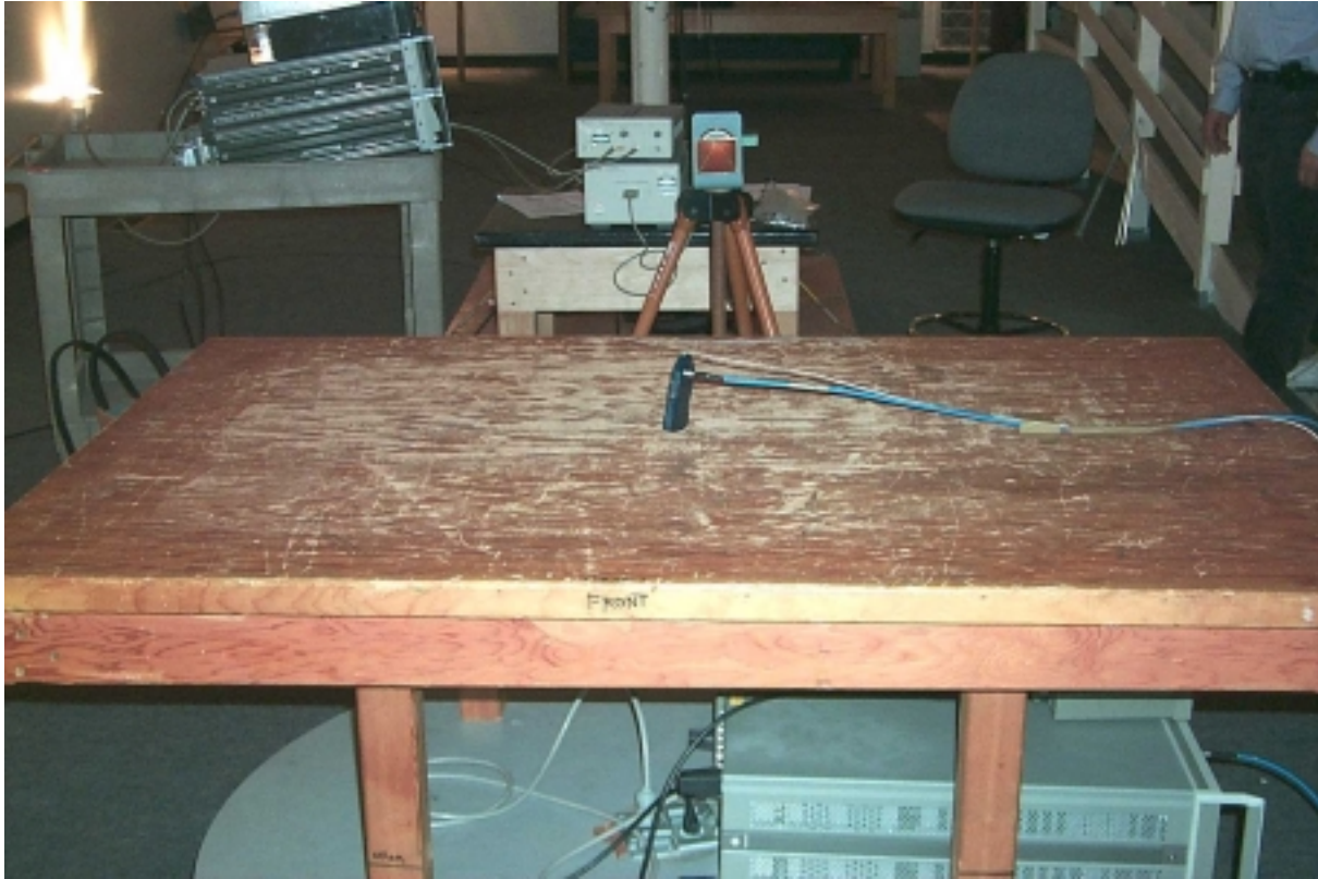
26.5-40.0Ghz emissions front side