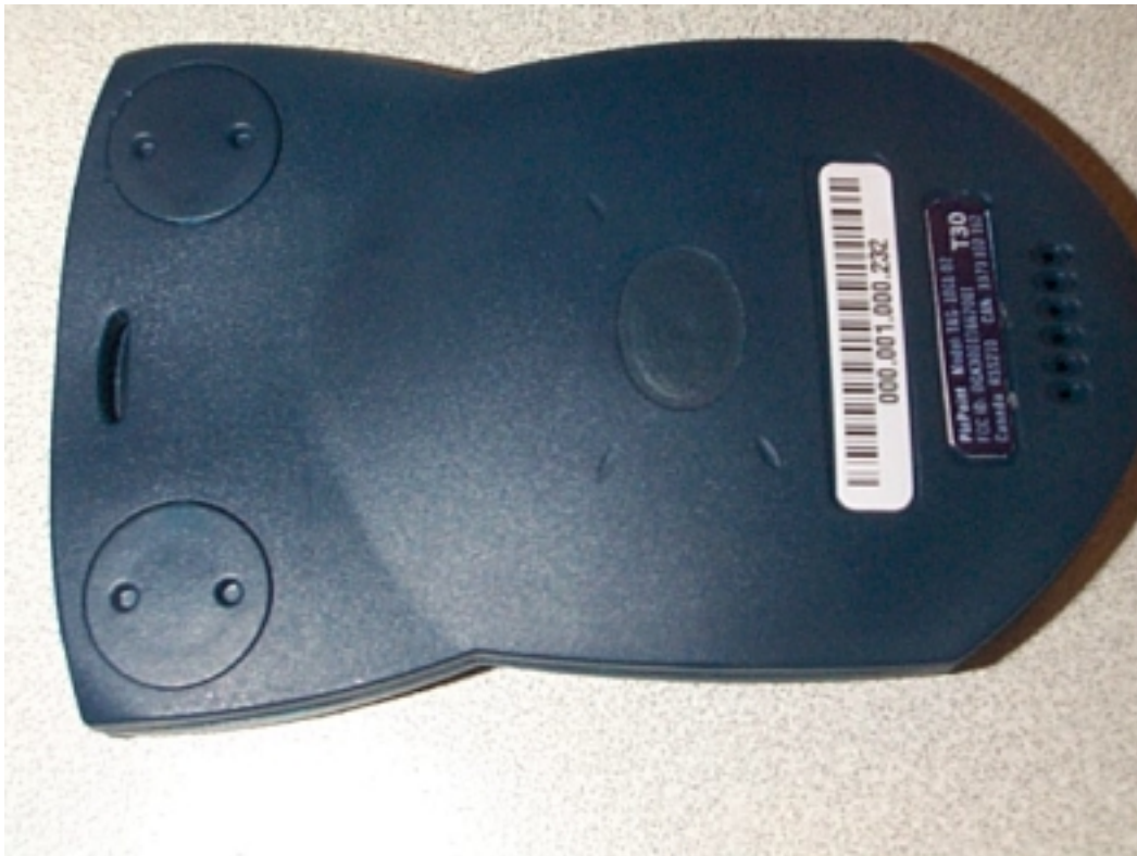
Label photo side 2