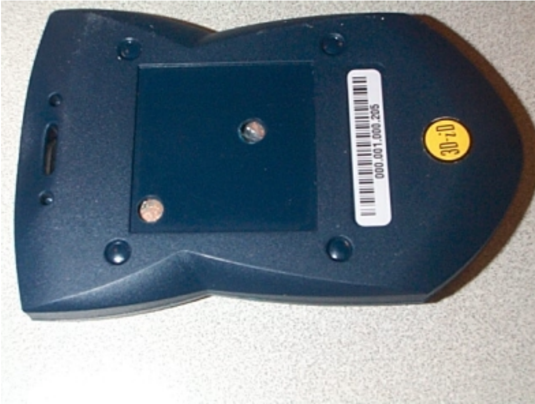
Label photo side one