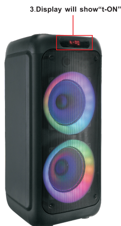
3. Display will show “t-ON”

2. Press “Pause/Play” button for 3 seconds on one of the speakers to turn on/off the TWS function