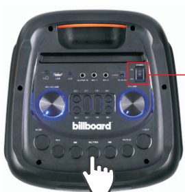
1. POWER ON/OFF

Using TWS: Press the “Pause/Play” button for 3 seconds on one of the speakers to turn on/off the TWS function, display will show “t-ON” on one of the speakers. Go to your Bluetooth® device, select “BB-BT-SP , TWS will be connected /disconnected successfully.