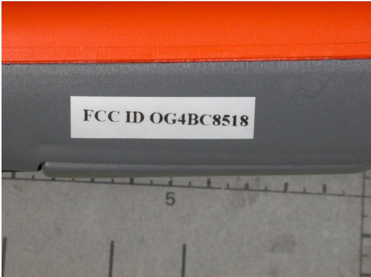
Detail view of label FCC ID