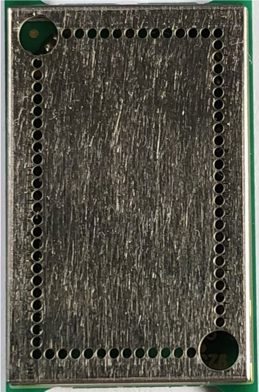
Figure 1 Size of module is 19.60 x 12.60 mm