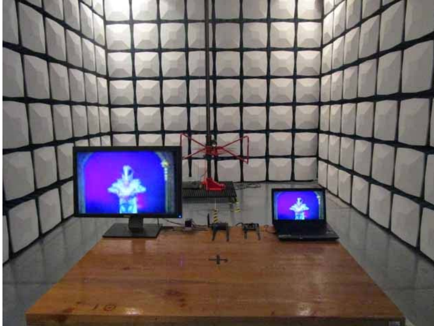
Radiated Emission – Rear View (Below 1G)