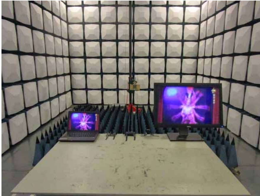
Radiated Emission – Rear View (Above 1G Distance 1.5m)