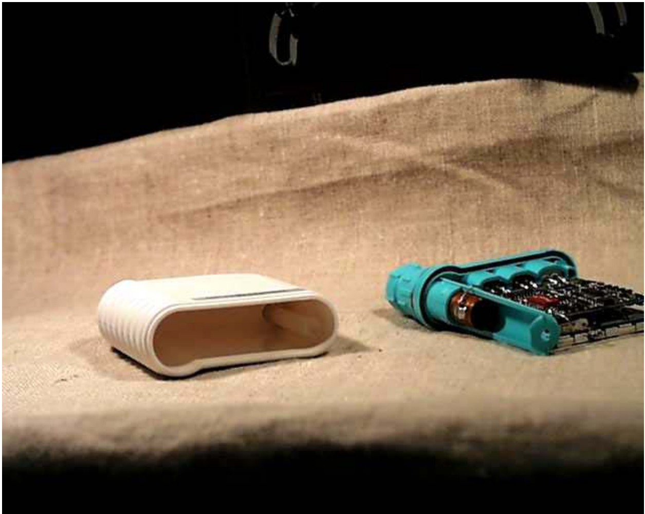
Figure 1: Inside cover