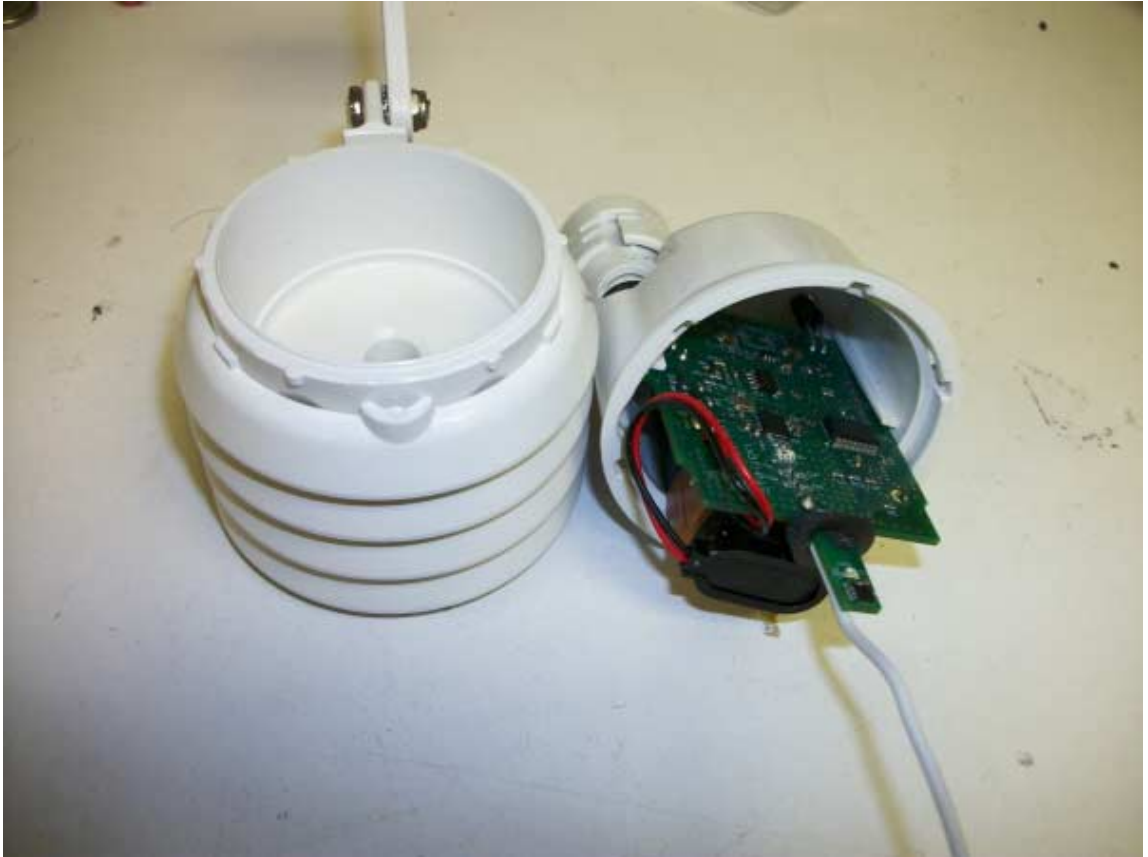
7.3 Inside View