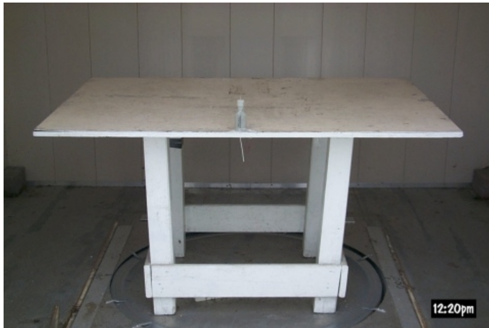
Figure 3.1 Radiated Test Setup, Front