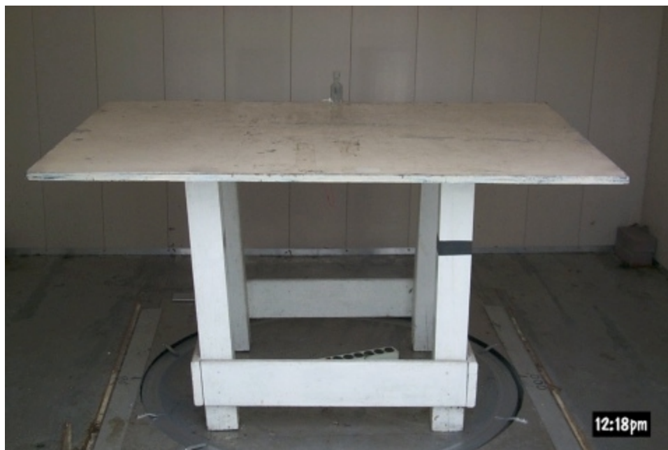
Figure 3.2 Radiated Test Setup, Rear