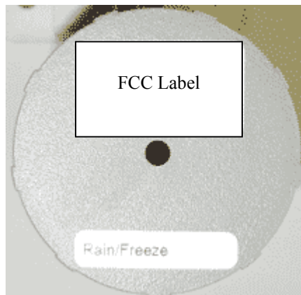
Fig 2.2 Location of the Label