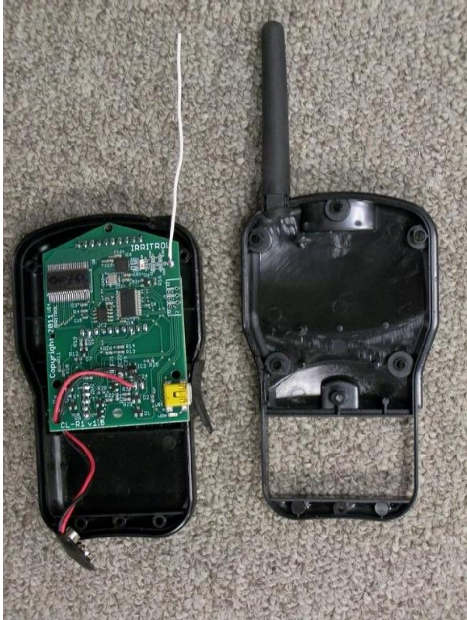
7.3 Inside View