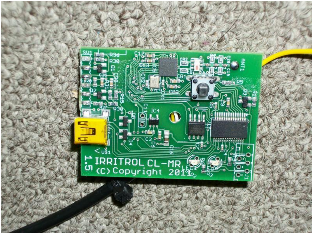
7.4 PCB Component View