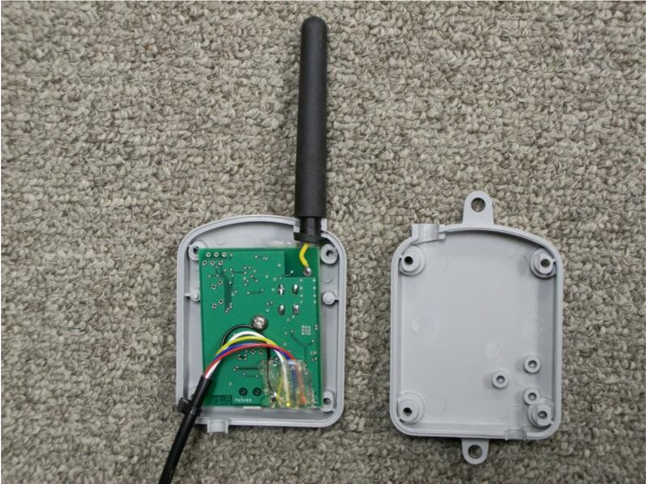
7.3 Inside View