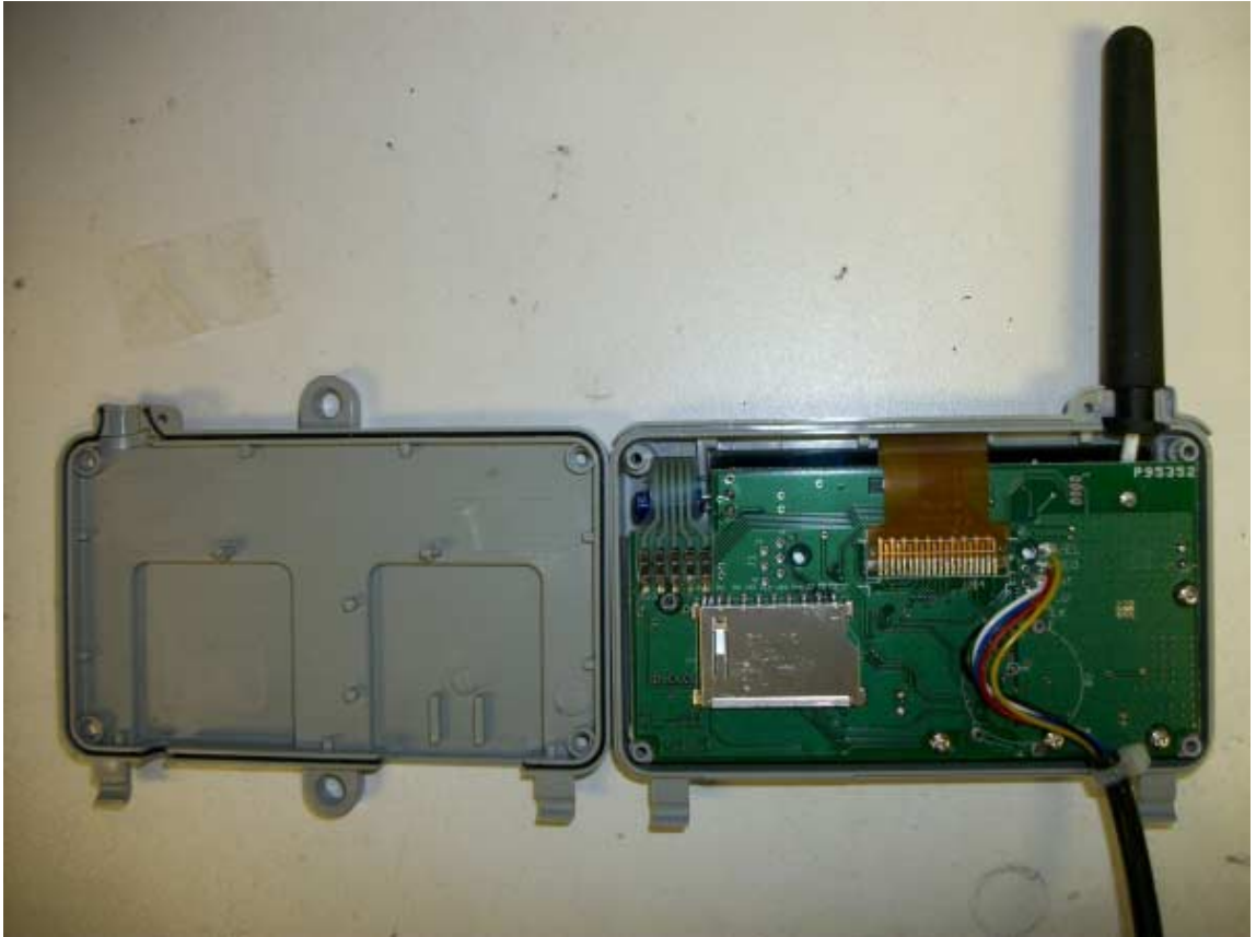
7.3 Inside View