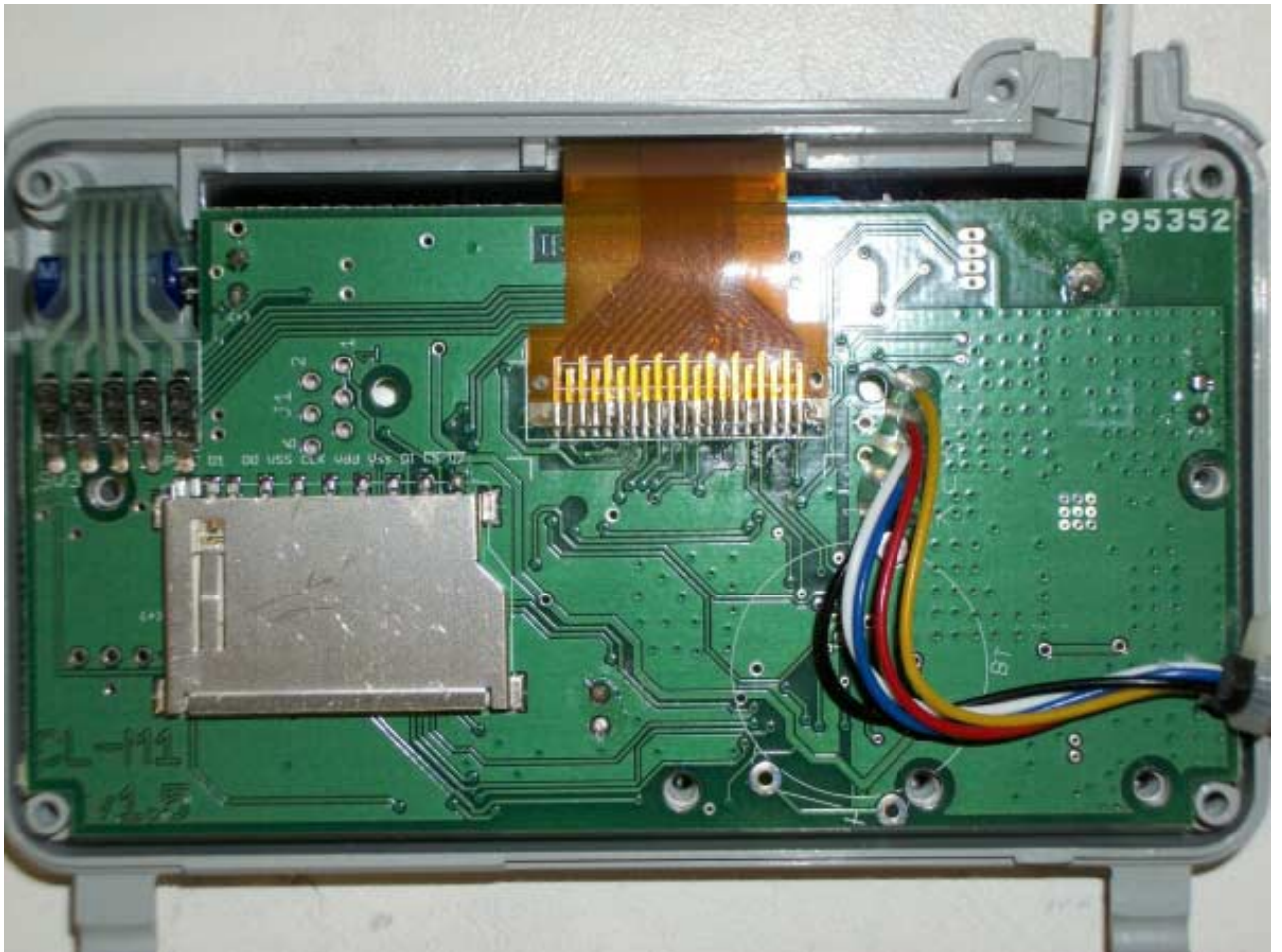
7.5 PCB Foil View