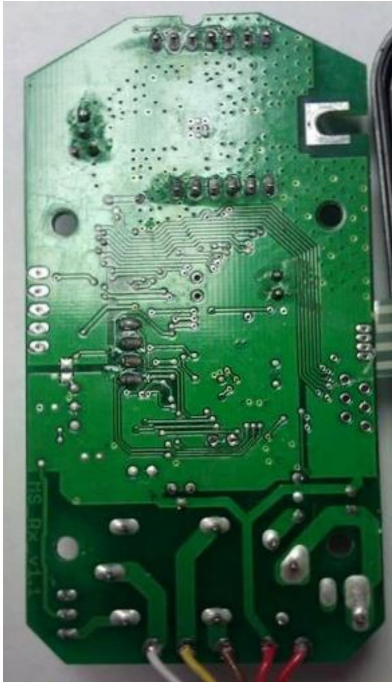
7.5 PCB Foil View