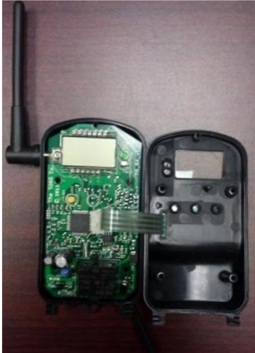
7.3 Inside View