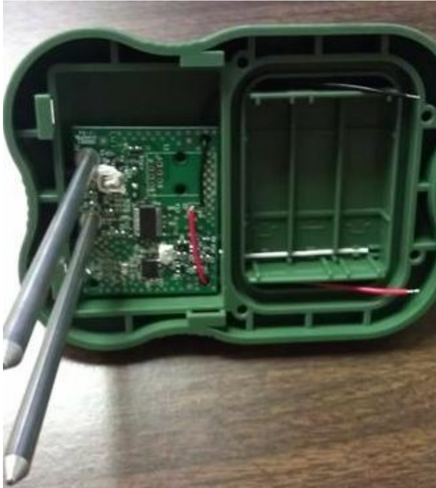
7.3 Inside View