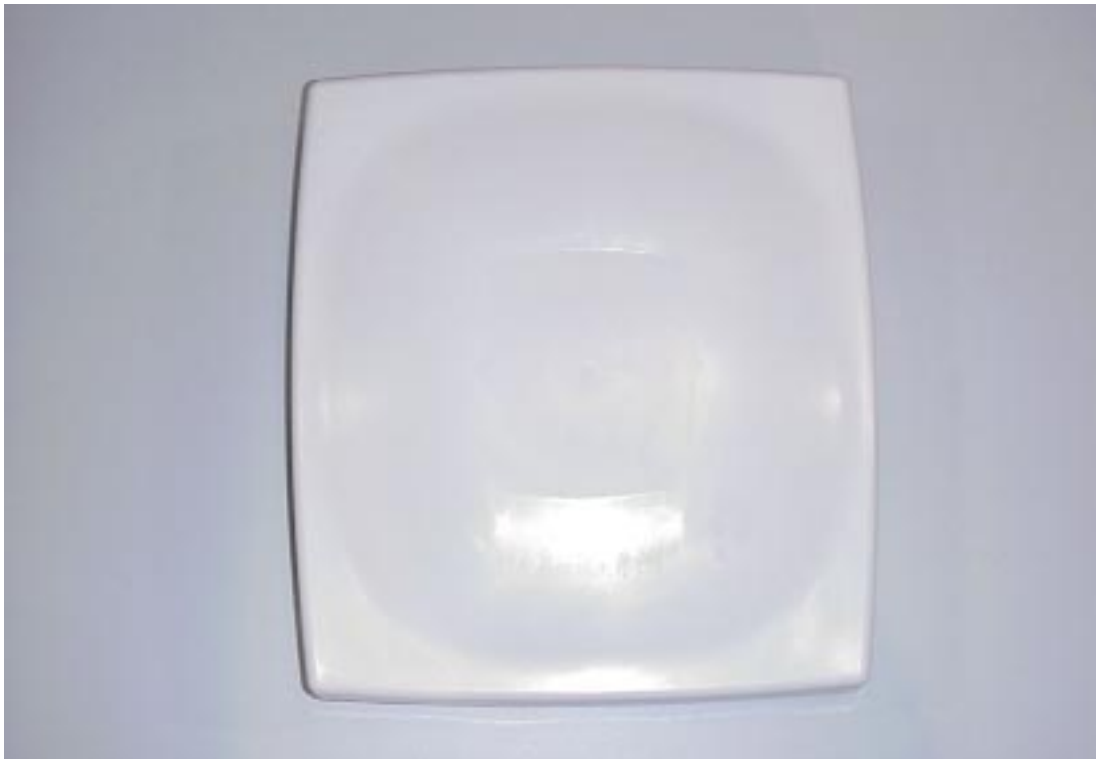
Figure 4.6 Front View of the R3 WCS Outdoor Unit Antenna

The front face of the R3 WCS Outdoor Unit has an HB plastic radome which connects to a metallic back frame. The radome shown in Figure 4.6 , covers the antenna and measures approximately 12 inches by 14 inches.