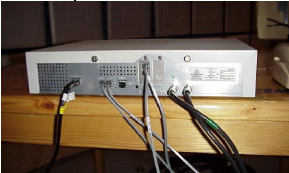
Figure 4.4 Rear view of the R3 Indoor Unit

Note: Figure 4.4 also shows the UL/FCC label location.