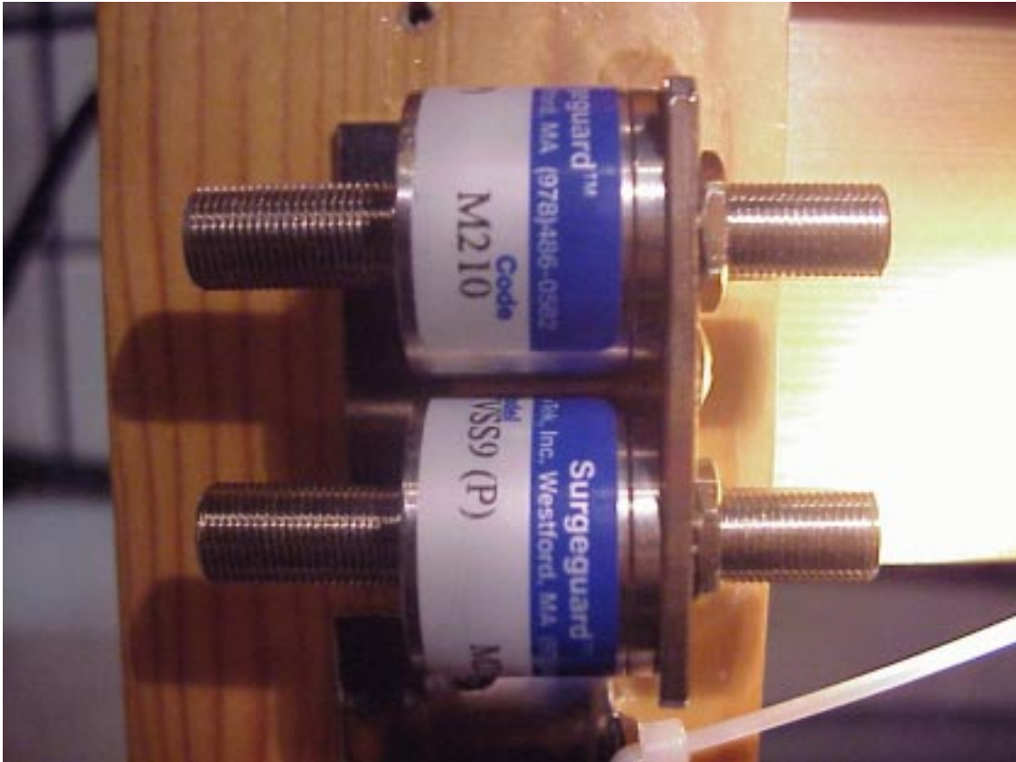
Figure 4.5 R3 WCS Surge Protector

Figure 4.5 depicts the gas tube surge protector manufactured by NEXTEC. This protects the R3 Indoor Unit from indirect surges and transients that may flow on the coax to the R3 Indoor Unit. The coax provides DC voltage to the R3 WCS Outdoor Unit, along with Ethernet connection.