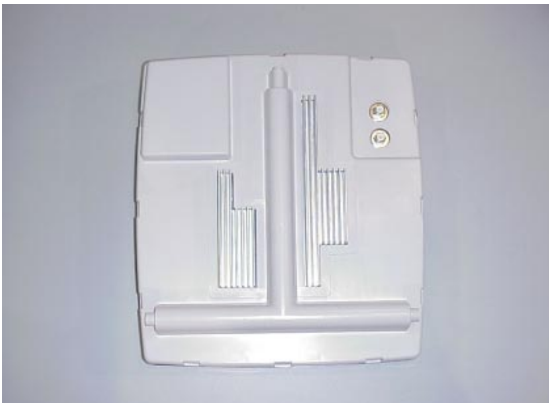
Figure 4.7 Rear View of the R3 WCS Outdoor Unit

Figure 4.7 shows the R3 WCS Outdoor Unit back view which identifies the RG-6 coaxial cable connections. The RG-6 coaxial connections provide the Ethernet connection and DC power to the R3 WCS Outdoor Unit from the R3 Indoor Unit.