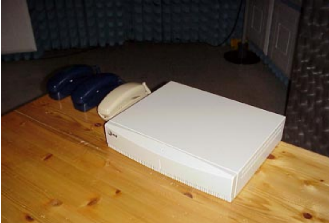
Figure 4.2 Right-side view of the R3 Indoor Unit

Figure 4.2 shows the R3 Indoor Unit, which identifies both front and side ventilation.