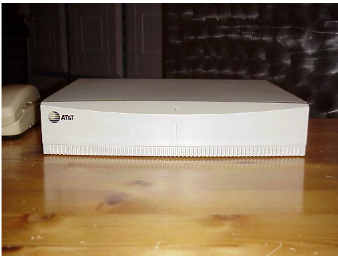
Figure 4.1 Front of the R3 Indoor Unit

The front face of the R3 Indoor Unit has an HB plastic decorative cover with a power LED inset as shown in Figure 4.1 . The enclosure is a sheet metal formed rectangular box measuring approximately 16 3/4"x12 1/2"x3 1/2".