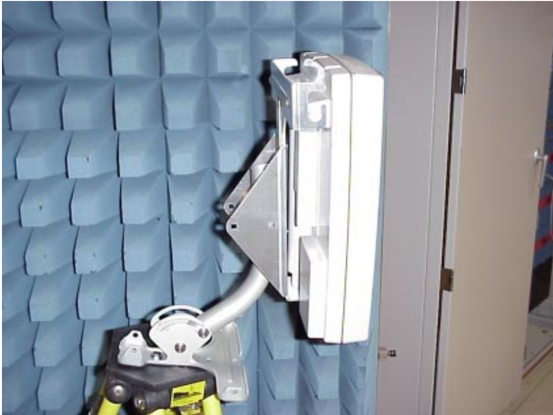
Figure 4.8 Side View of the Outdoor Unit with Mounting Bracket

Figure 4.8 shows the R3 WCS Outdoor Unit side view with the typical metallic mounting bracket.