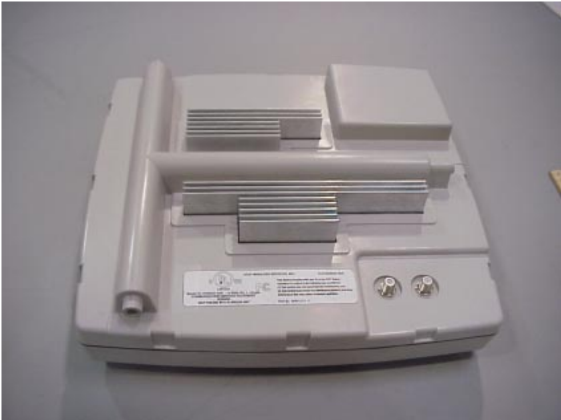
Figure 5.3 FCC ID Label Location on Antenna

Figure 5.3 shows the FCC ID label location on the backside of the R3 Outdoor Unit.