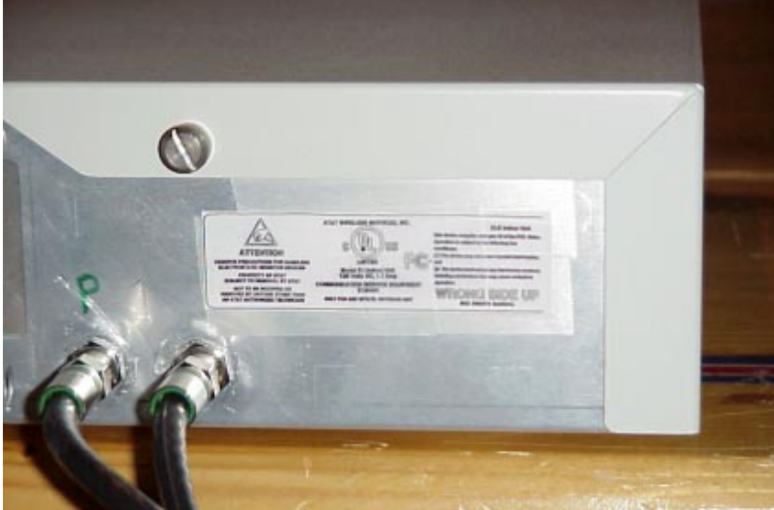
Figure 5.6 FCC Label Location on R3 Indoor Unit

Figure 5.6 shows a close-up of the FCC ID label on the R3 Indoor Unit.