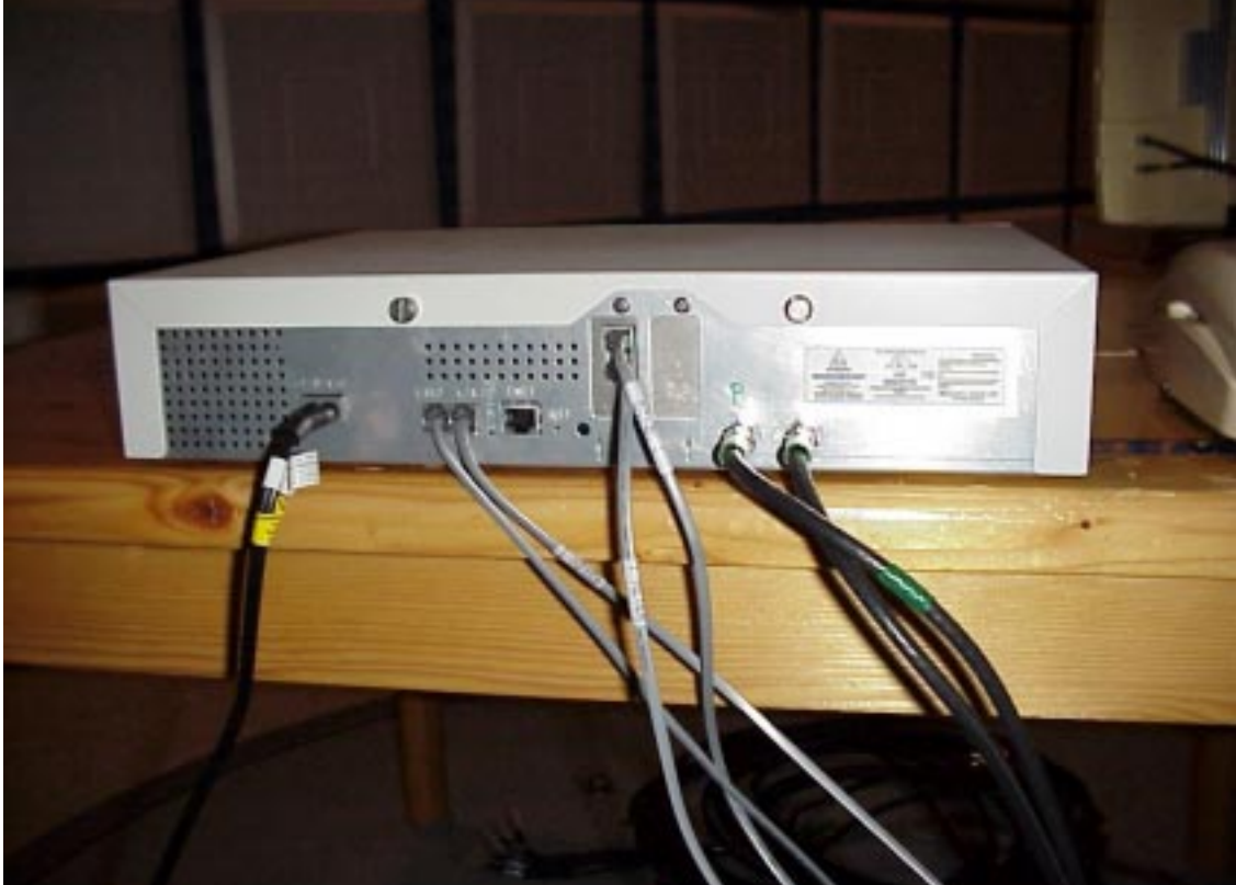
Figure 5.5 FCC ID Label Location on the R3 Indoor Unit

Figure 5.5 shows the FCC ID label location on the R3 Indoor Unit.