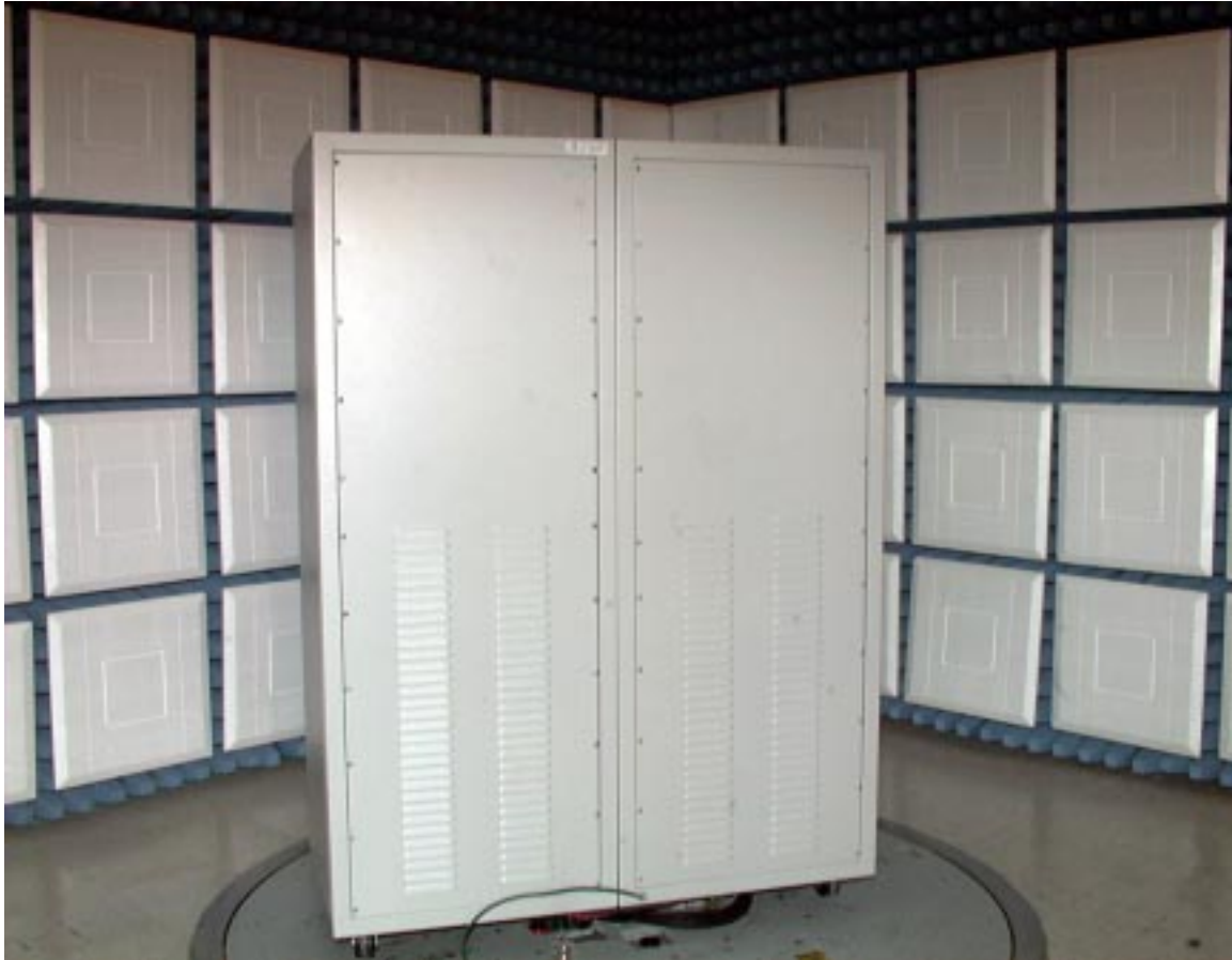
Figure 4.4 Back View of the FWAN WCS Base Station

The back of the FWAN WCS Base Station cabinet contains airflow ventilation as shown in Figure 4.4 .