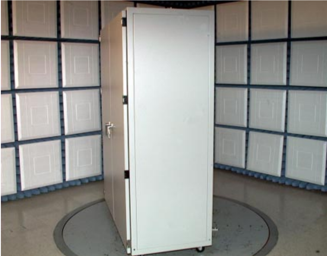
Figure 4.1 Front Corner View of the FWAN WCS Base Station

The front view of the FWAN WCS Base Station shows internal access via double doors. The double cabinet may be separated for various installation considerations. There are independent casters for additional mobility.