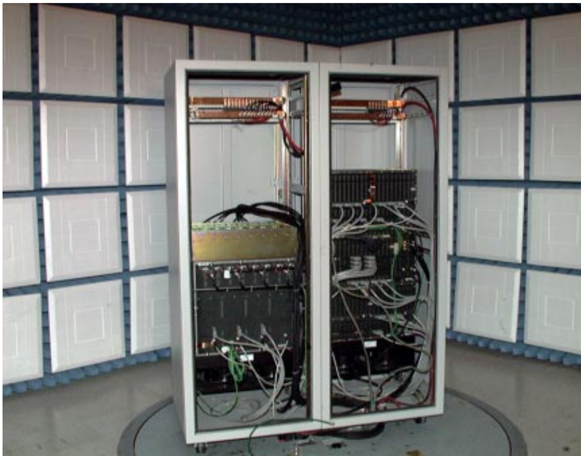
Figure 4.3 Open Panels Back View of the FWAN WCS Base Station

The interconnecting cabling between the digital and RF cabinets is shown in Figure 4.3 .