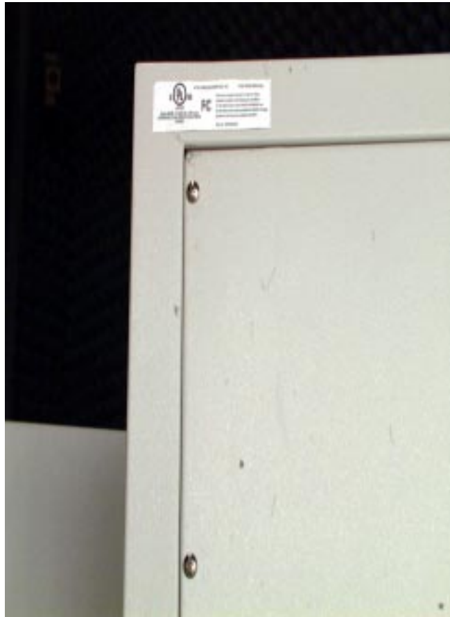
Figure 5.2 FCC Compliance Label—Possible exterior location