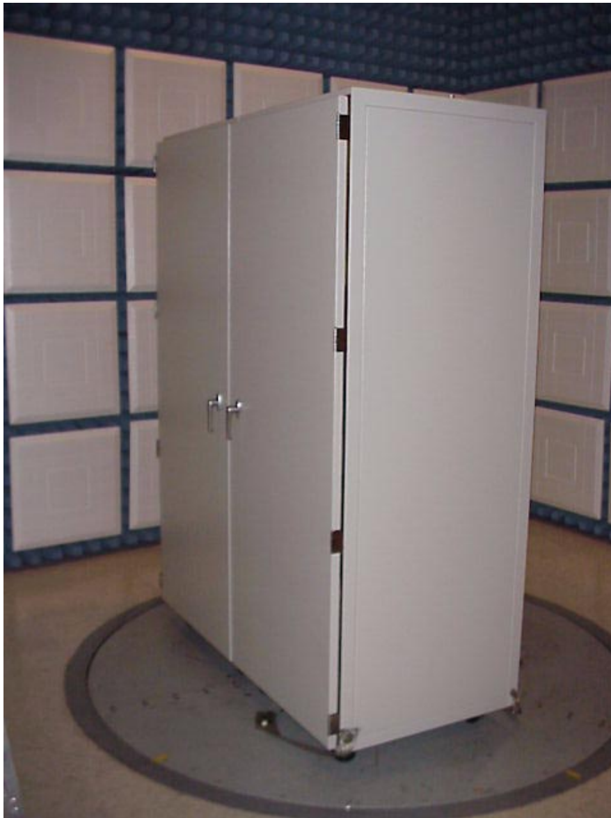
Figure 4.1 Front corner view of the PWAN Base Station

The front view of the PWAN Base Station shows internal access via double doors. The double cabinet may be separated for various installation considerations with independent casters for additional mobility.