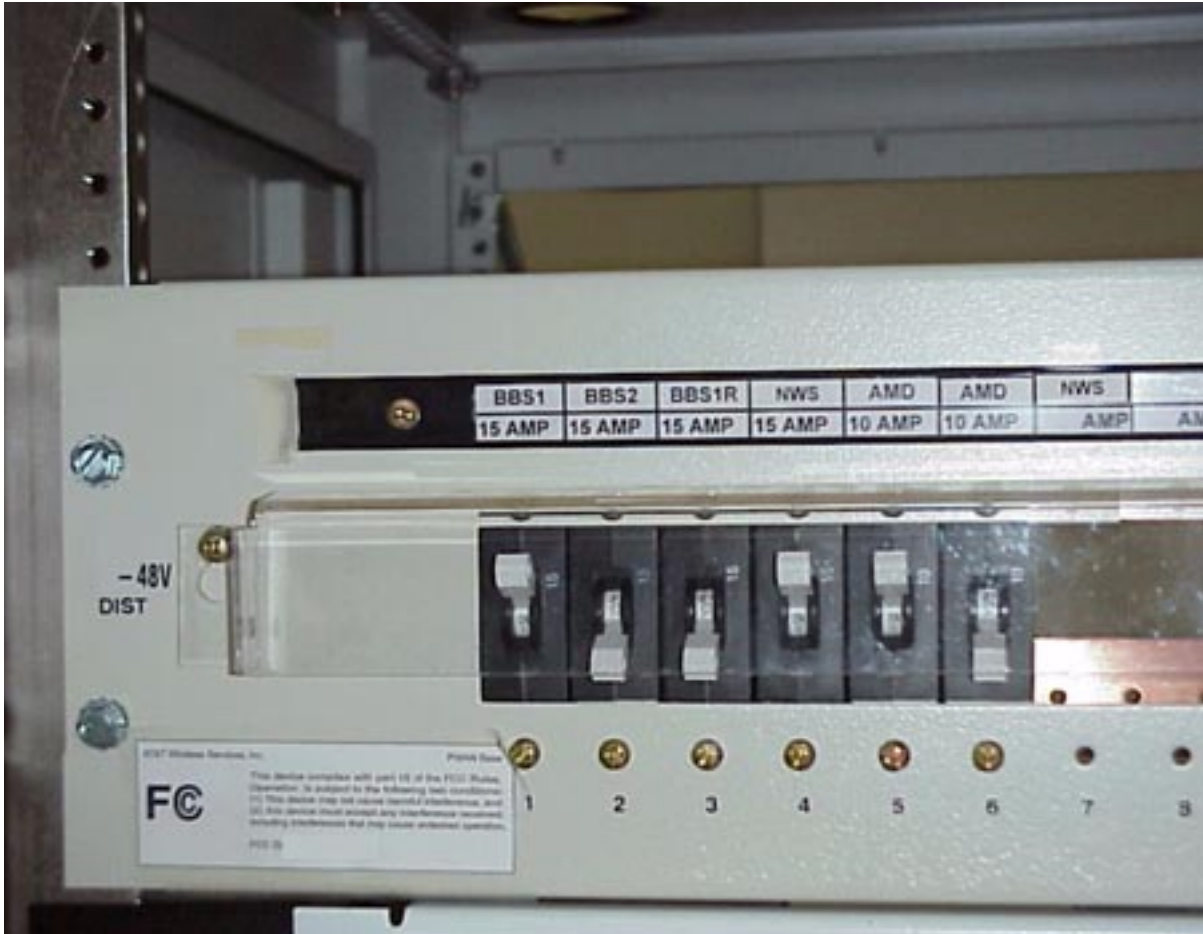
Figure 5.2— FCC Compliance Label—Possible interior location