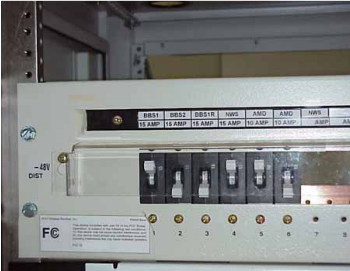
Figure 5.2— FCC Compliance Label—Possible interior location