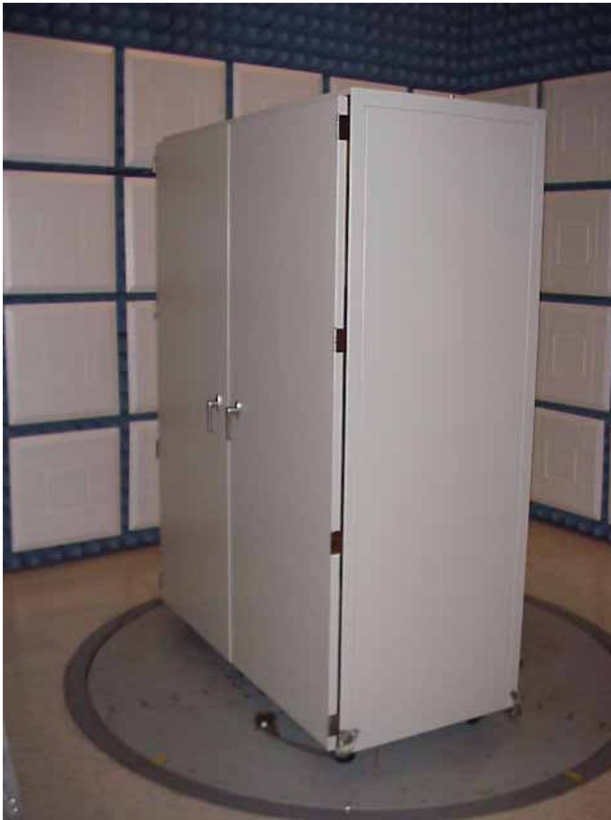
Figure 4.1— Front corner view of the PWAN Base Station

The front view of the PWAN Base Station shows internal access via double doors. The double cabinet may be separated for various installation considerations with independent casters for additional mobility.