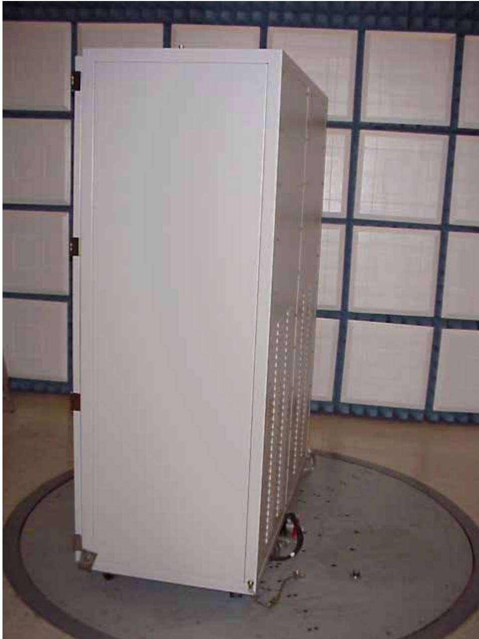
Figure 4.2— Side view of the PWAN Base Cabinet

The back of the PWAN Base Cabinet contains airflow ventilation as shown in figure 4.2.