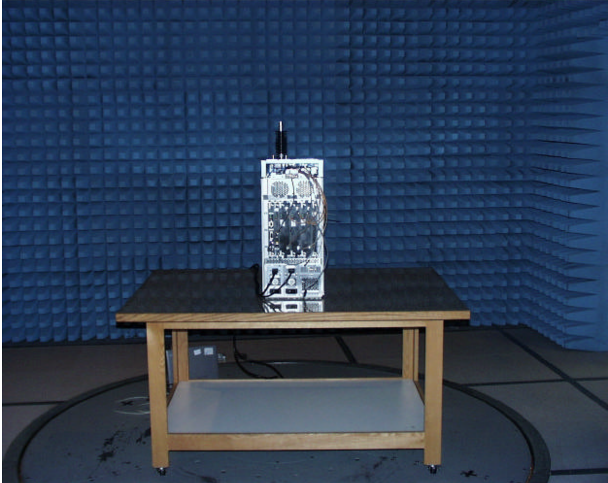
Front view of worst case radiated and line conducted emissions