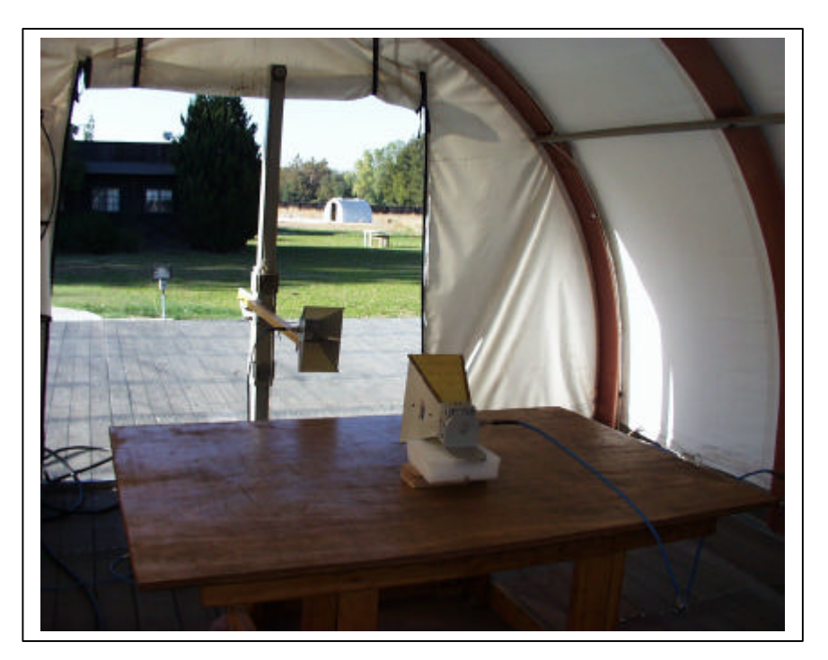
RADIATED & SUBSTITUTION MEASUREMENTS