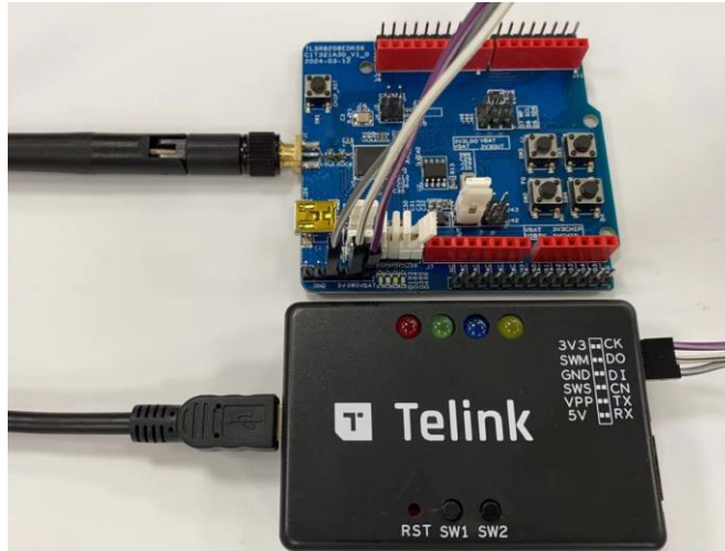
Figure 1-3 VBAT 3.3V power supply