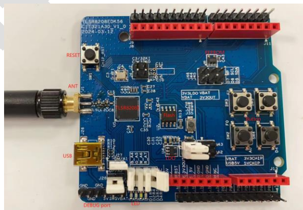
Figure 1-4 Function modules on the board

As shown in figure 1-4, The functions of each module on the board have been marked. There are LED, button , flash and download port on board. The LED lights can indicate what status the TLSR8208EDK56D is in. This makes it an solution for low cost IoT (Internet of Things) and 2.4 Ghz devices. The TLSR8208E integrates hardware acceleration to support the complicated security operations required by Bluetooth, without the requirement for an external DSP.