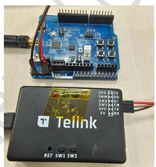
Figure 2-3 VBAT 3.3V power supply

As shown in figure 2-3, the marker is the 3.3V and GND port.