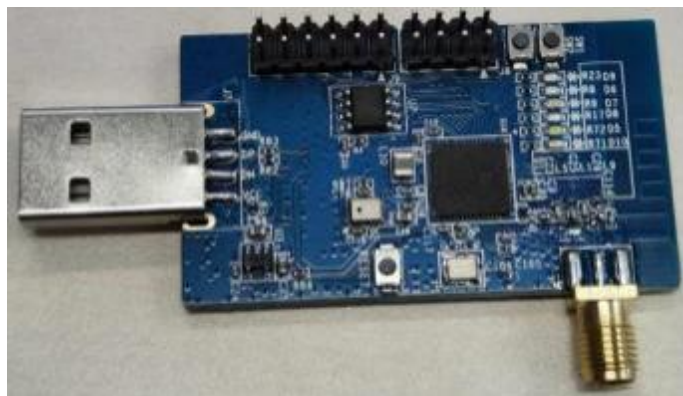
Figure 2-1 USB power supply

The TL7218H-EVK94D supports supply power via USB or other 3.3V power. As shown in figure 1-1, the marker is the USB port. Power can be supplied when USB is plugged in.