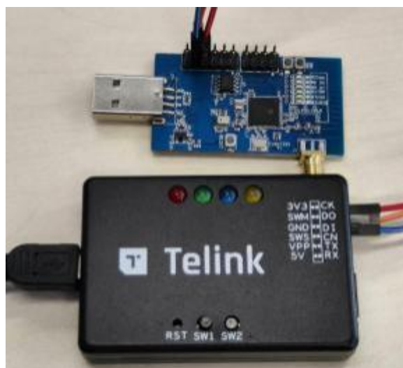
Figure 2-2 3.3V power supply

NOTICE :As shown in figure 1-2, the marker is the 3.3V and GND port. It is only used for the power supply of downloading firmware, the chip may not work under normal use.