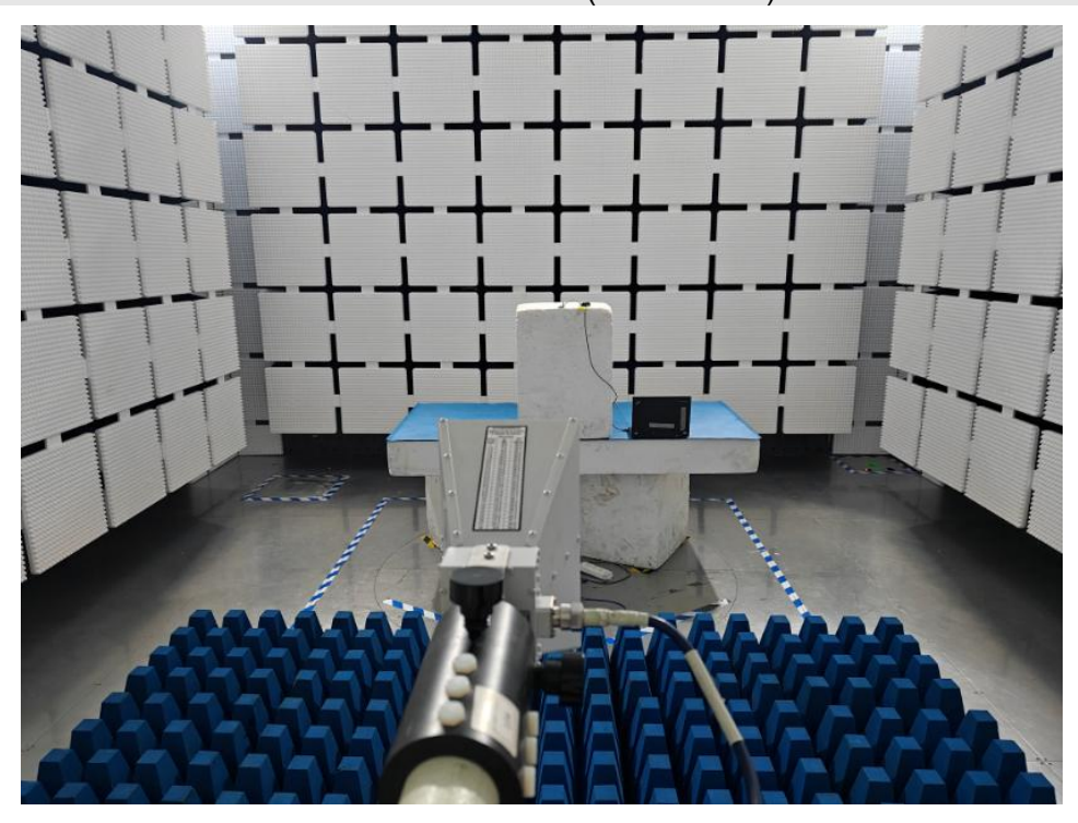
EUT Setting details