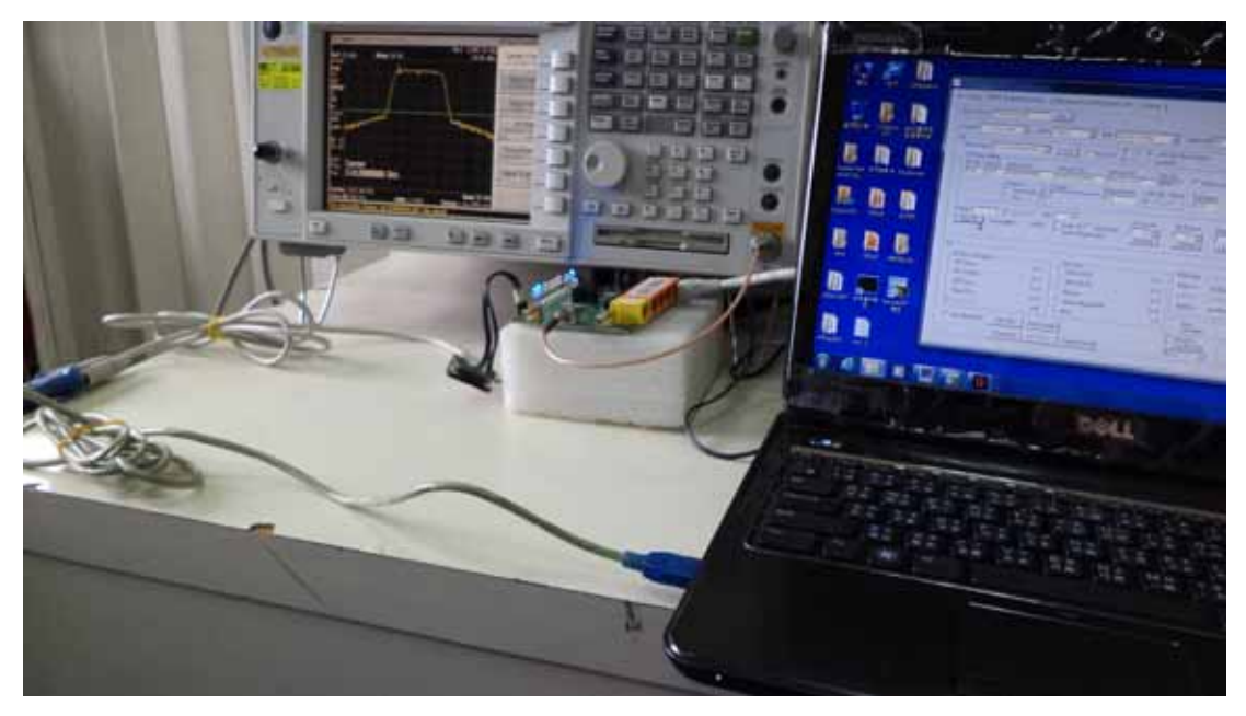
10.2.Photo of RF Conducted Measurement