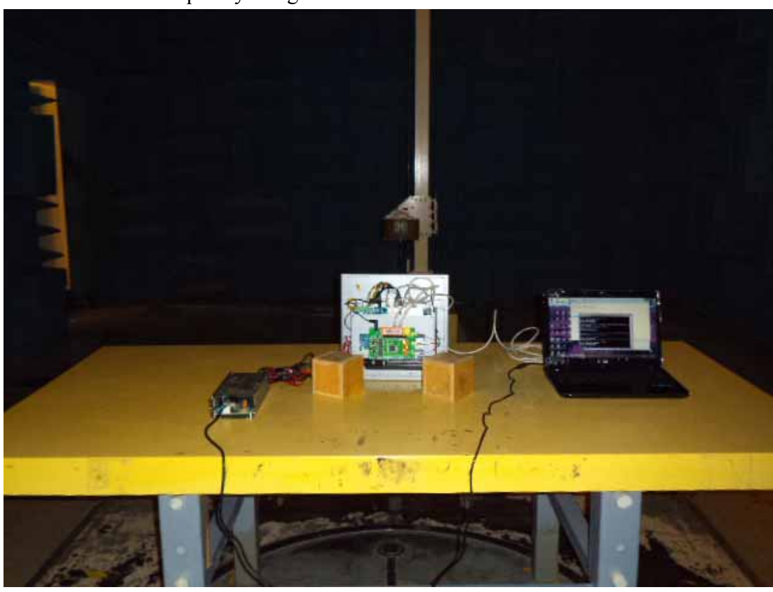
10.1.2.Frequency Range Above 1GHz