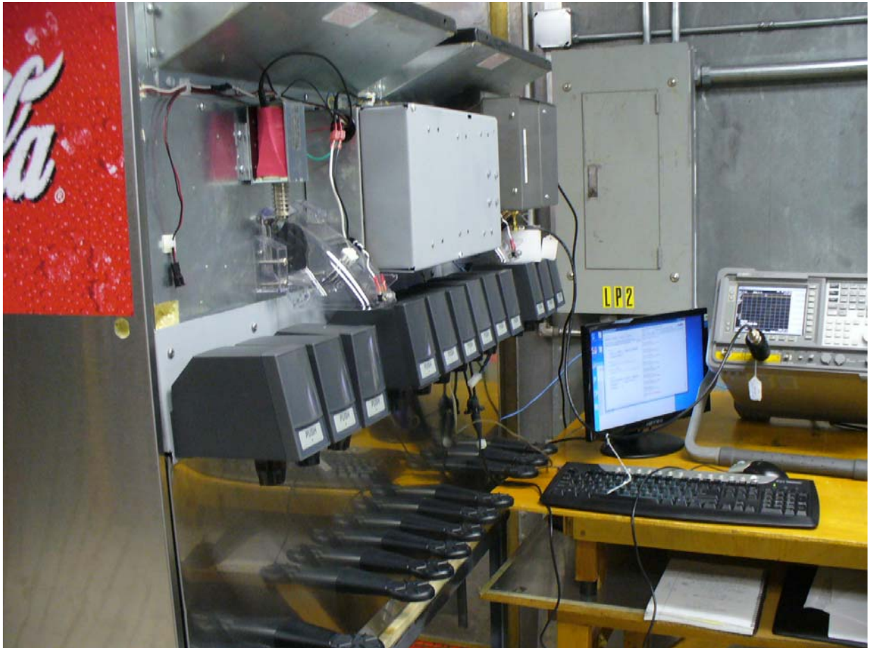
Figure 3: RF Conducted Emissions