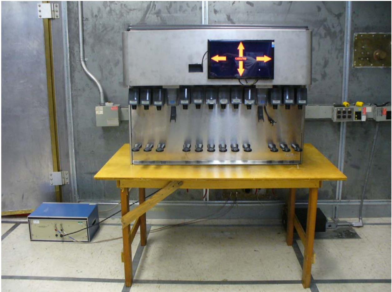
Figure 4: Power Line Conducted Emissions – Front View