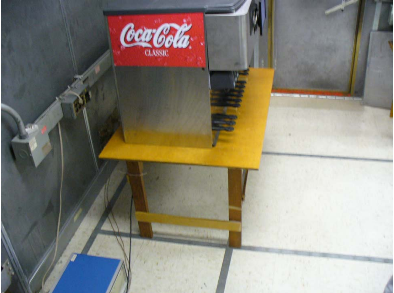
Figure 5: Power Line Conducted Emissions – Side View