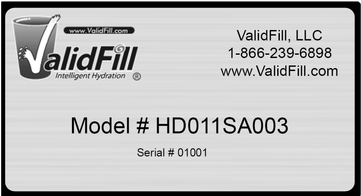
Figure 2: Sample Label (2)