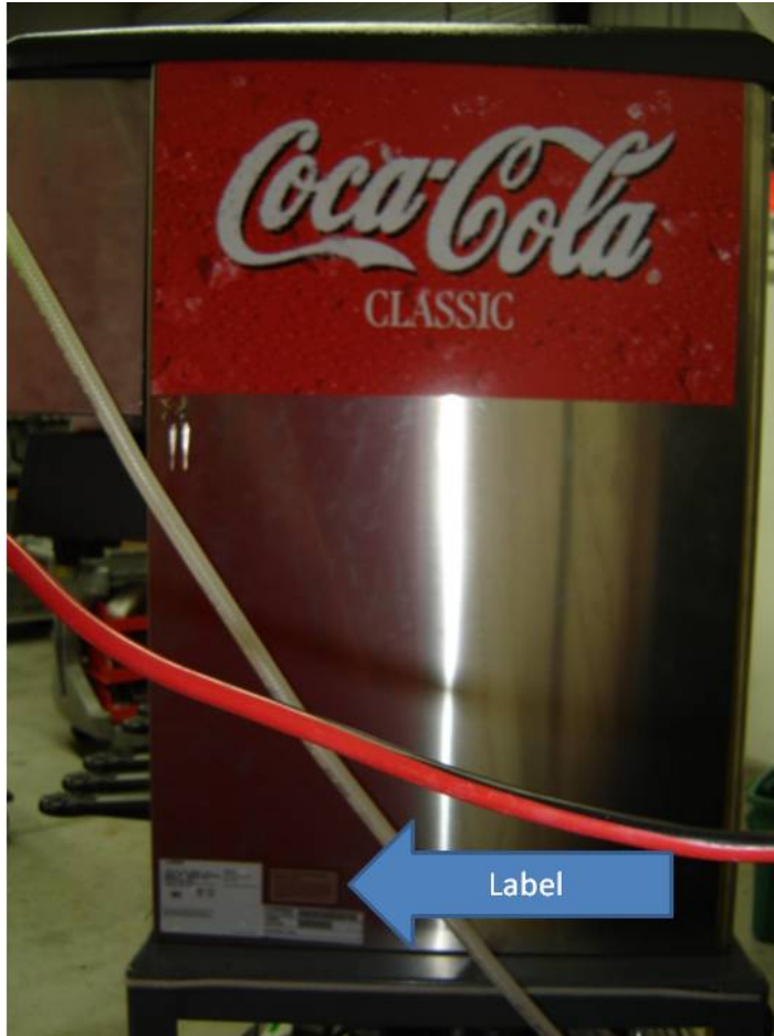
Figure 3: Sample Label Location