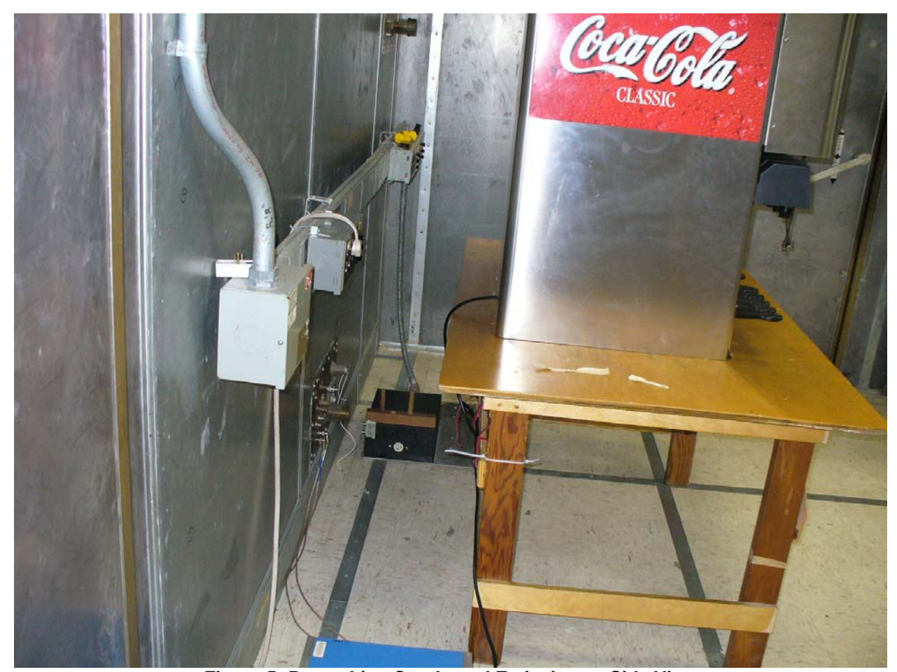
Figure 5: Power Line Conducted Emissions – Side View