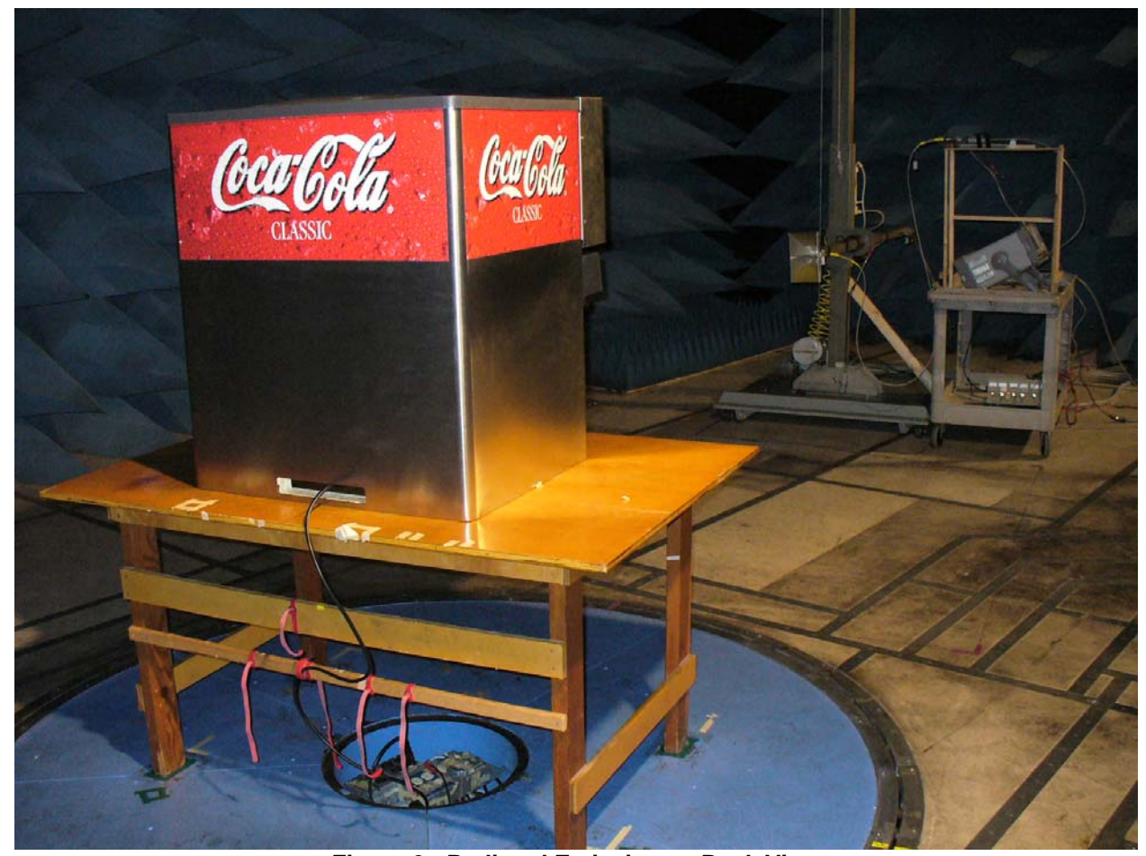
Figure 2: Radiated Emissions – Back View