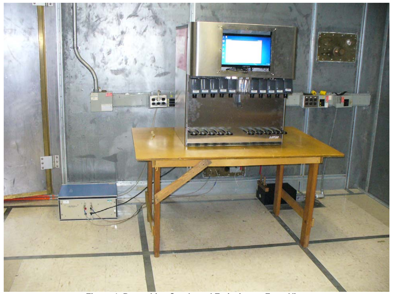
Figure 4: Power Line Conducted Emissions – Front View