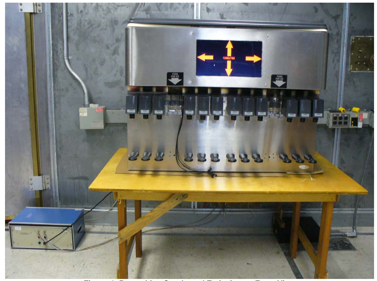
Figure 4: Power Line Conducted Emissions – Front View