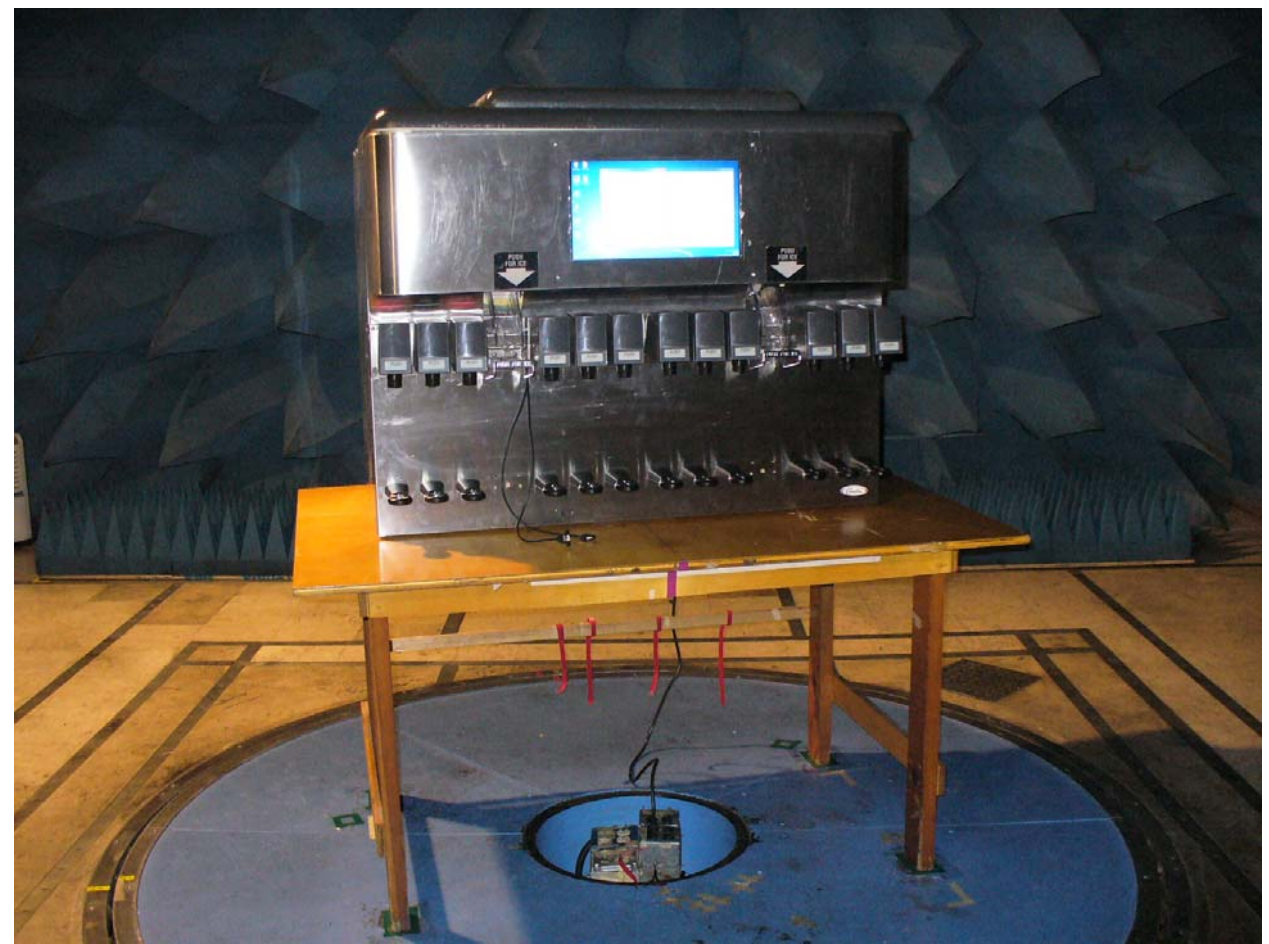
Figure 1: Radiated Emissions – Front View