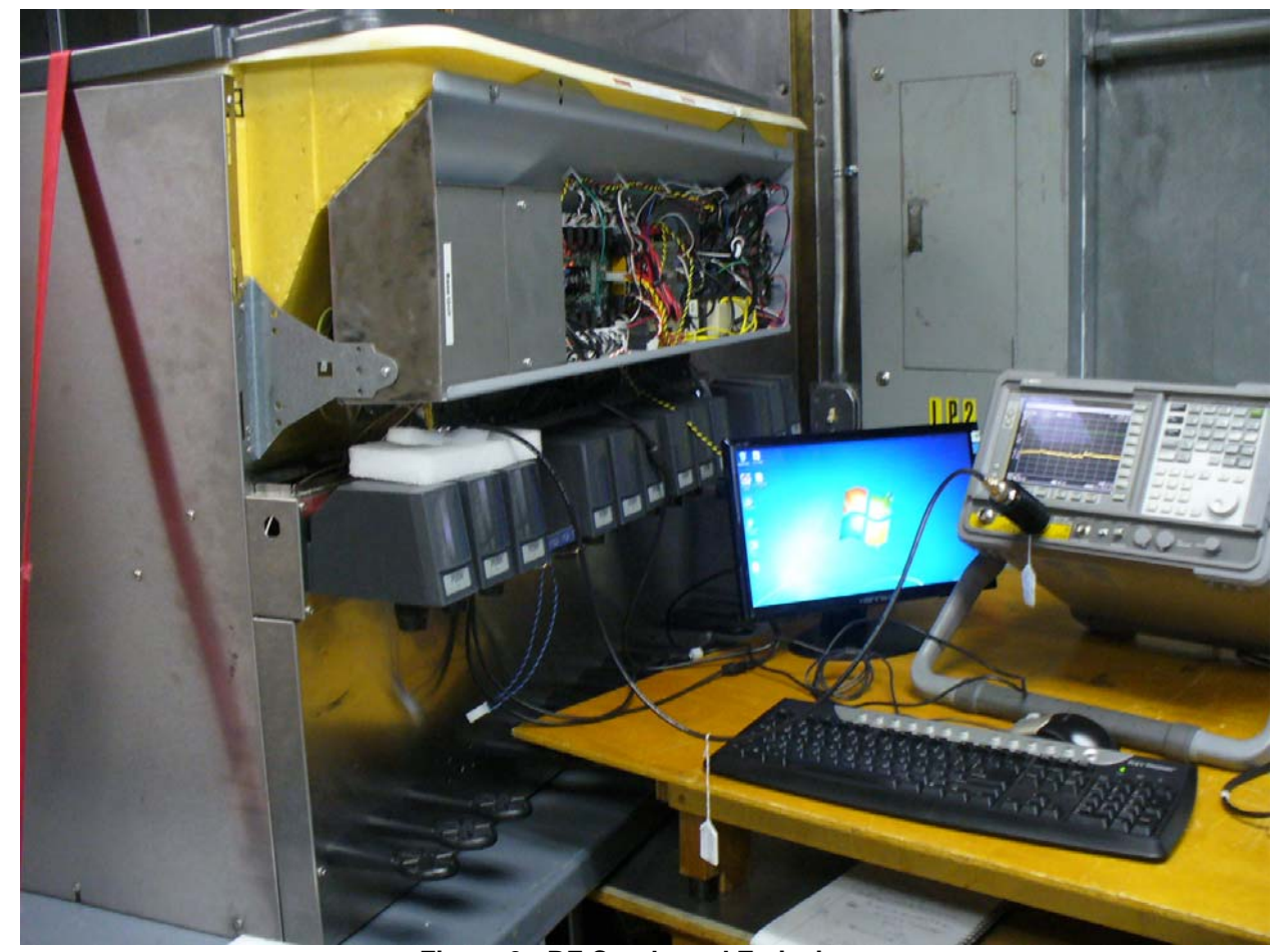
Figure 3: RF Conducted Emissions