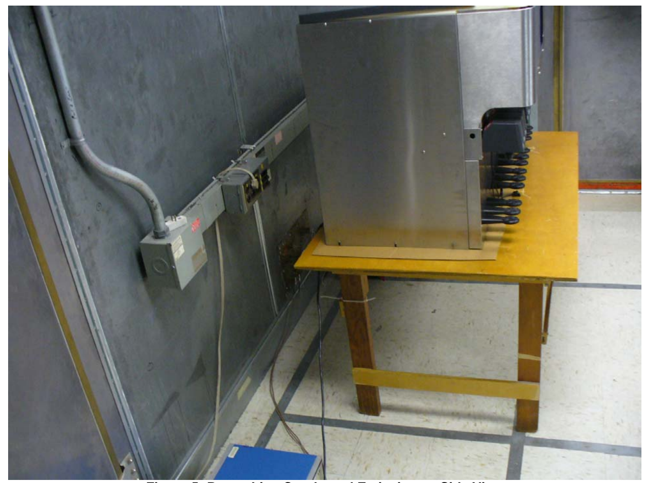
Figure 5: Power Line Conducted Emissions – Side View