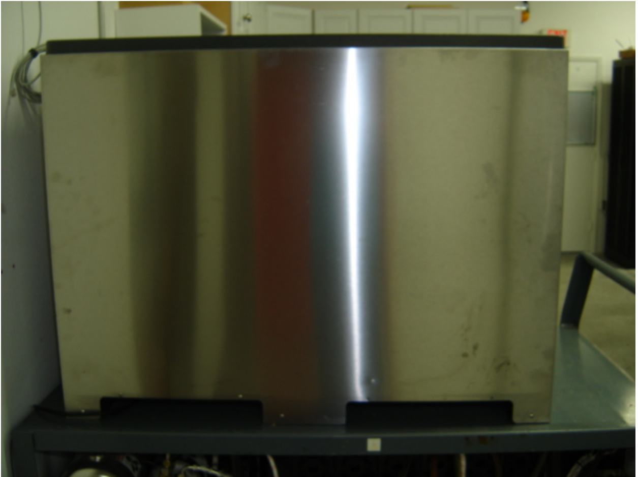
Figure 2: Rear View