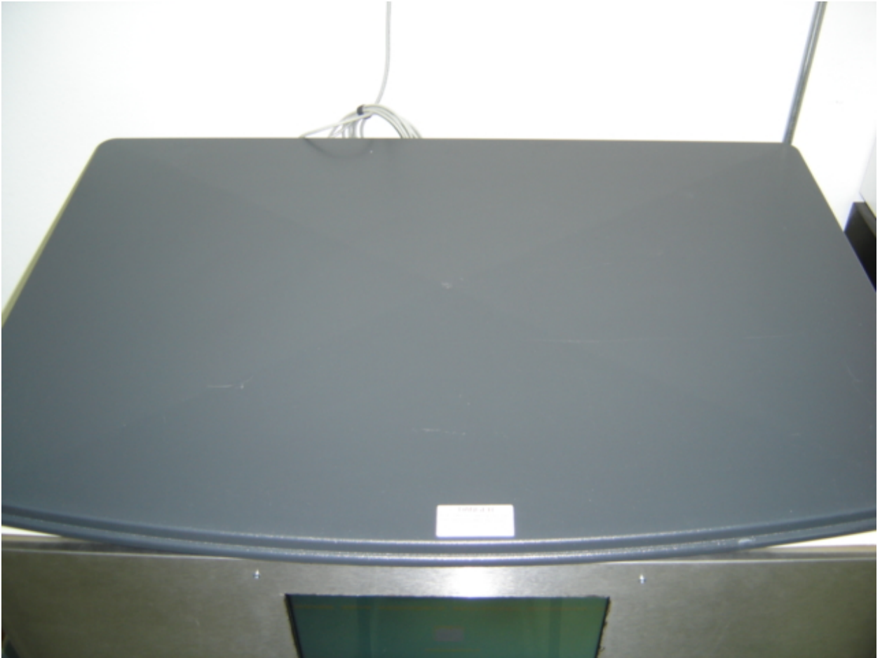
Figure 3: Top View