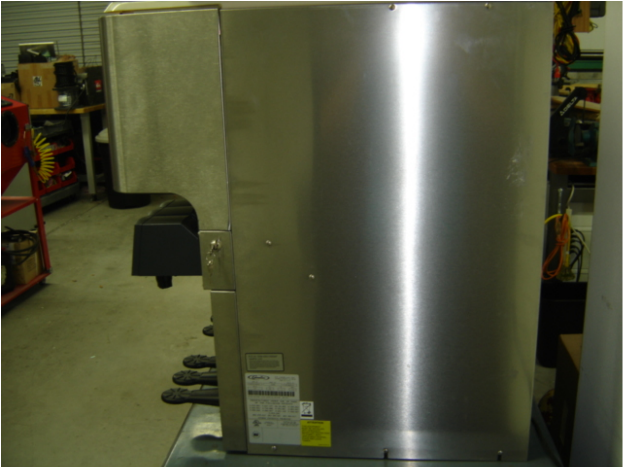
Figure 5: Right Side View