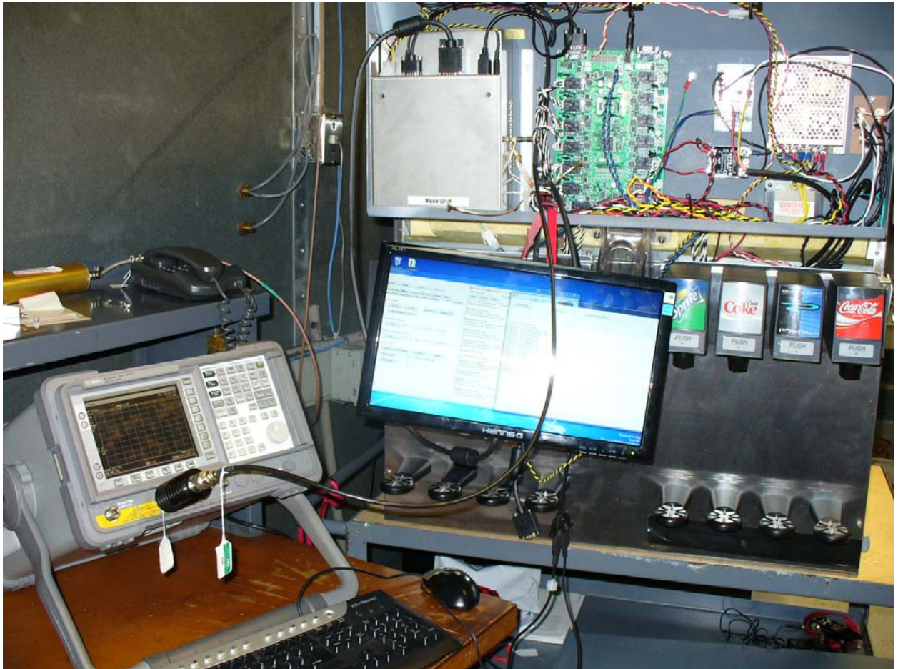
Figure 3: RF Conducted Emissions