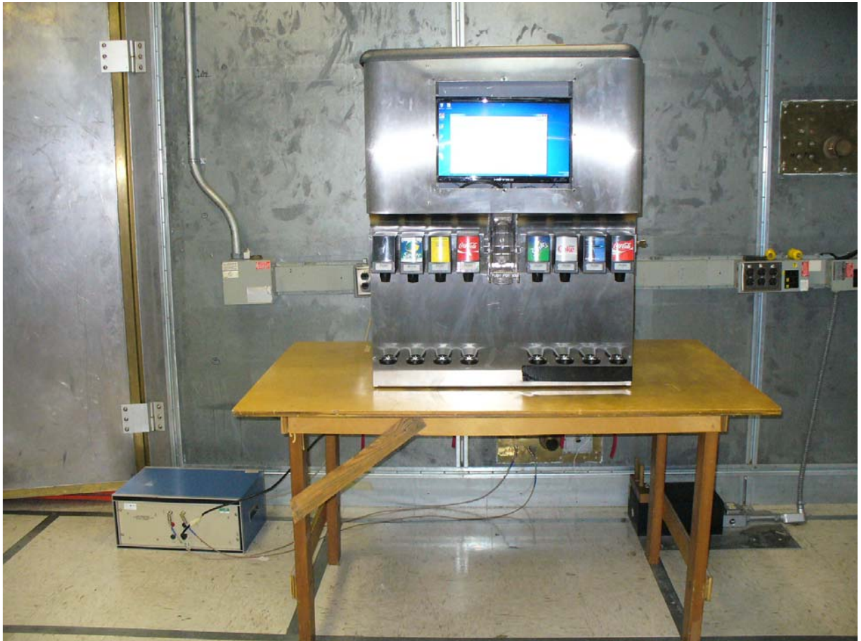
Figure 4: Power Line Conducted Emissions – Front View