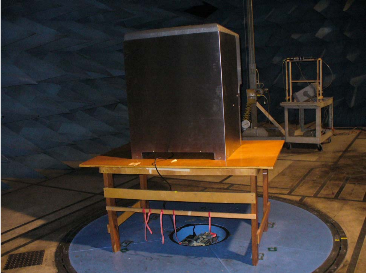
Figure 2: Radiated Emissions – Back View