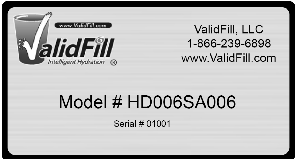
Figure 2: Sample Label (2)