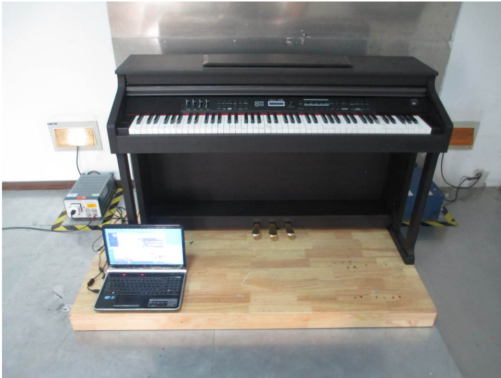
Conducted Emissions Test Setup Front View