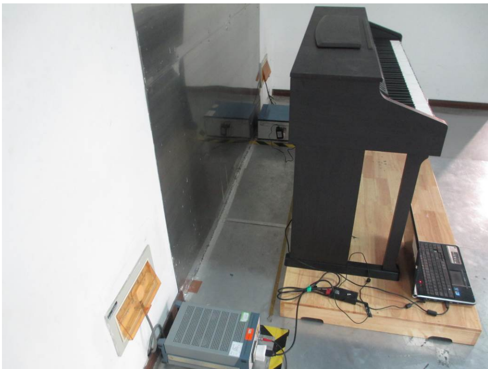
Conducted Emissions Test Setup Side View