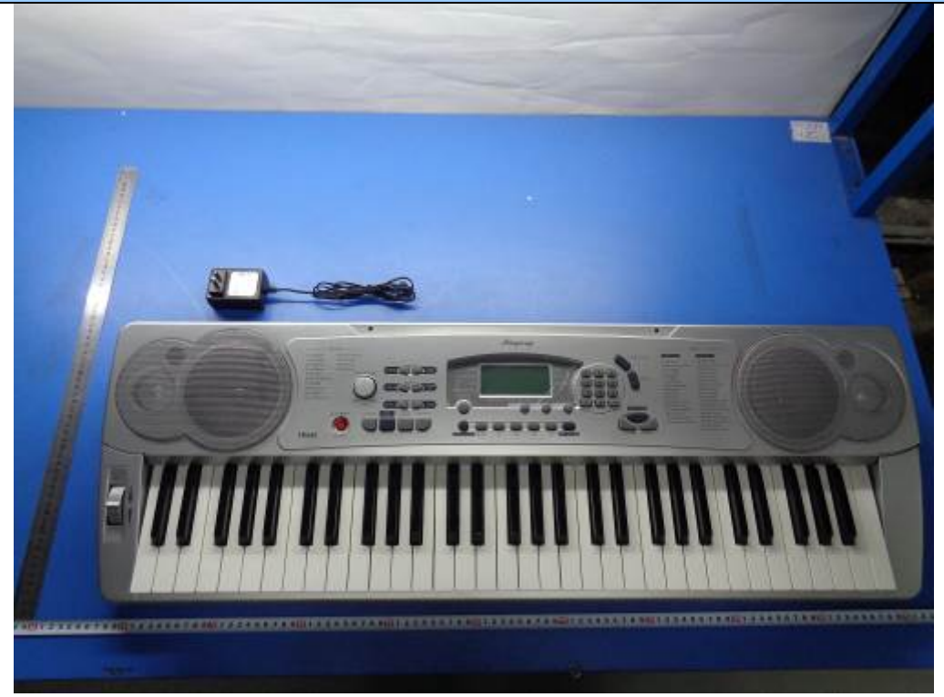
Whole Package - Front View