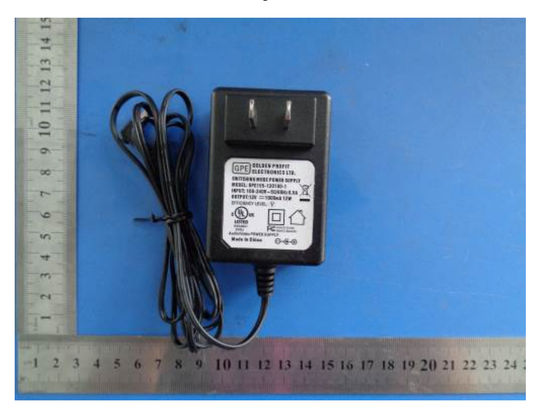
Adapter -- Front View