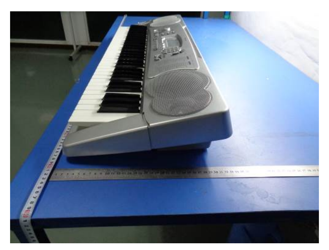
EUT - Right View