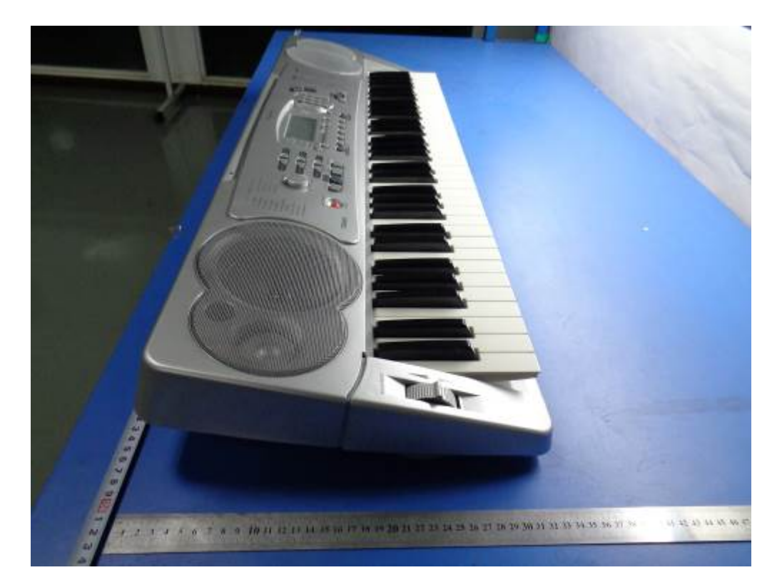
EUT - Left View

Report No.:14020404-FCC-EIssue Date:August 11, 2014Page:22 of 34