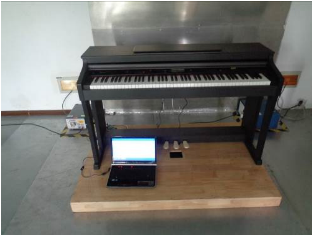
Conducted Emissions Test Setup Front View