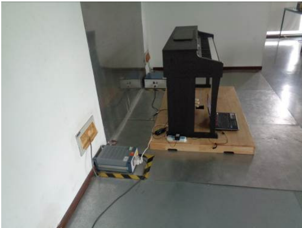
Conducted Emissions Test Setup Side View