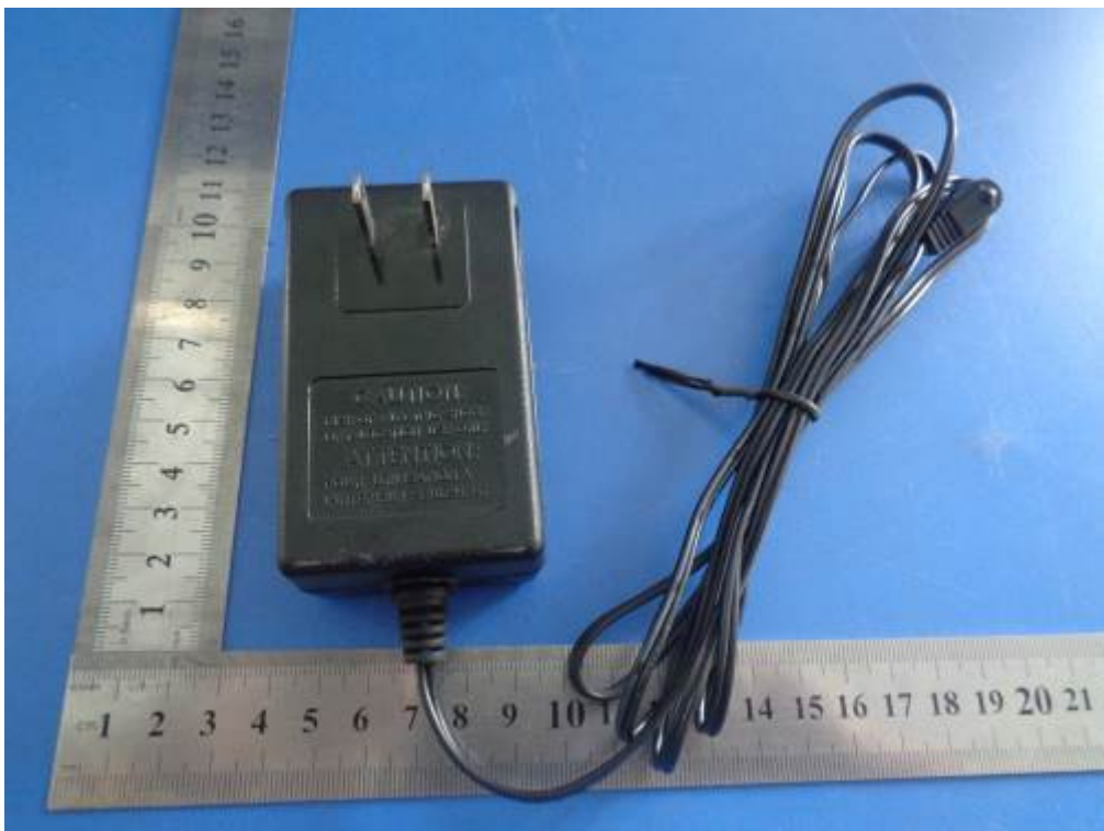
Rear View of Adapter