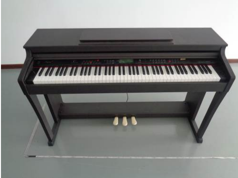
EUT - Front View