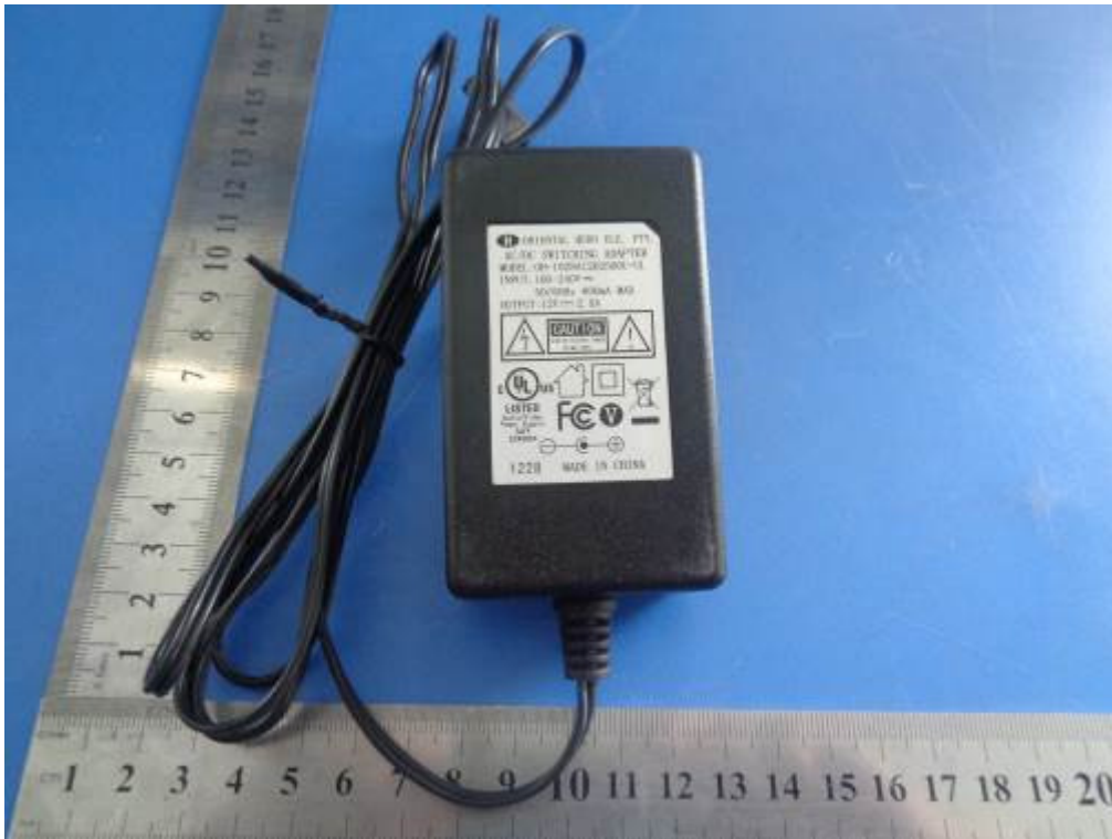
Label Front View of Adapter

Report No.: 14020396-FCC-E Issue Date: June 13, 2014 Page: 22 of 34 www.siemic.com.cn