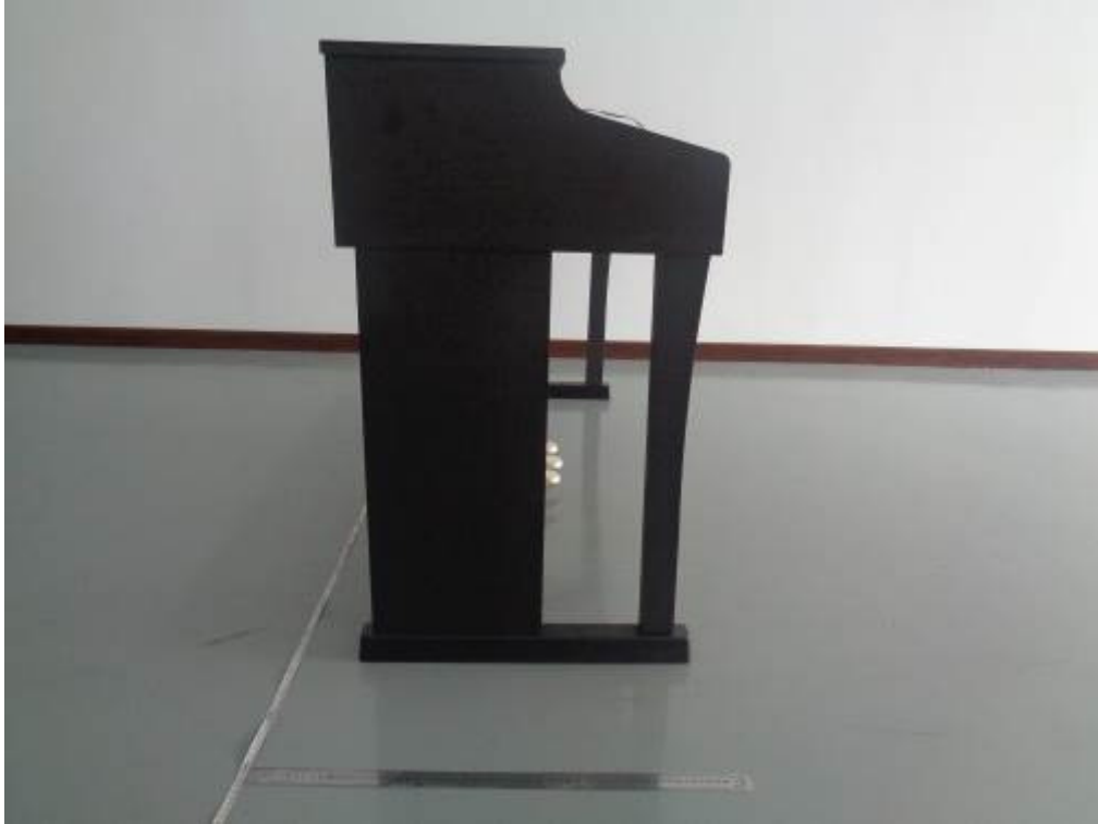
EUT - Left View

Report No.: 14020396-FCC-E Issue Date: June 13, 2014 Page: 21 of 34 www.siemic.com.cn