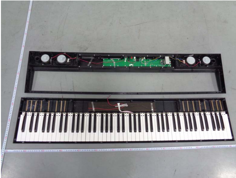
Uncover - Front View