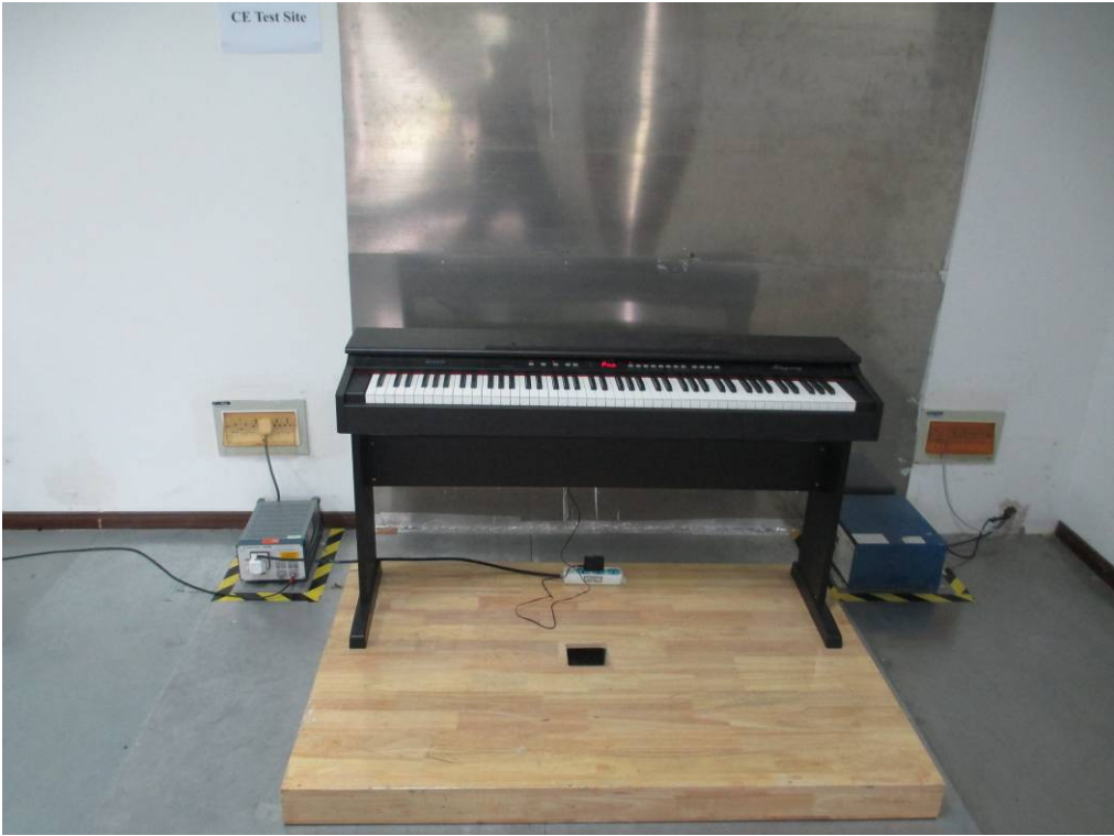
Conducted Emissions Setup Front View