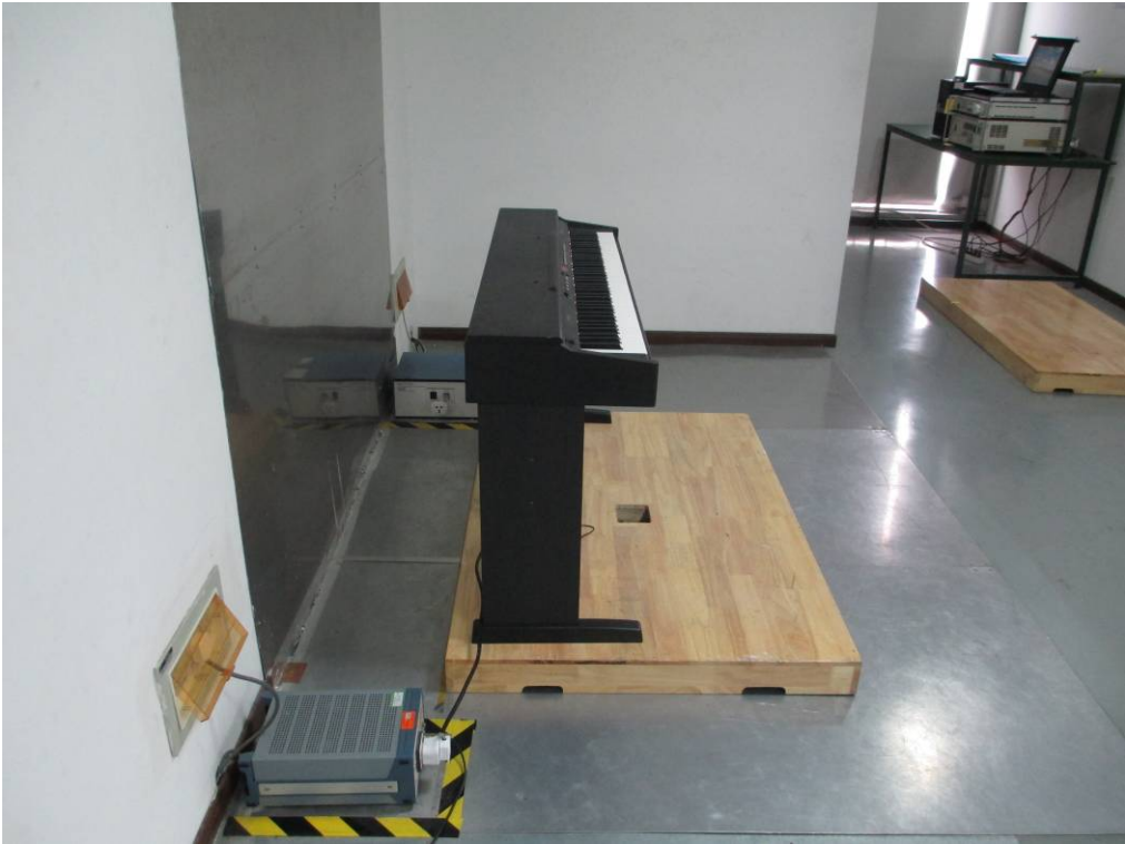
Conducted Emissions Setup Side View